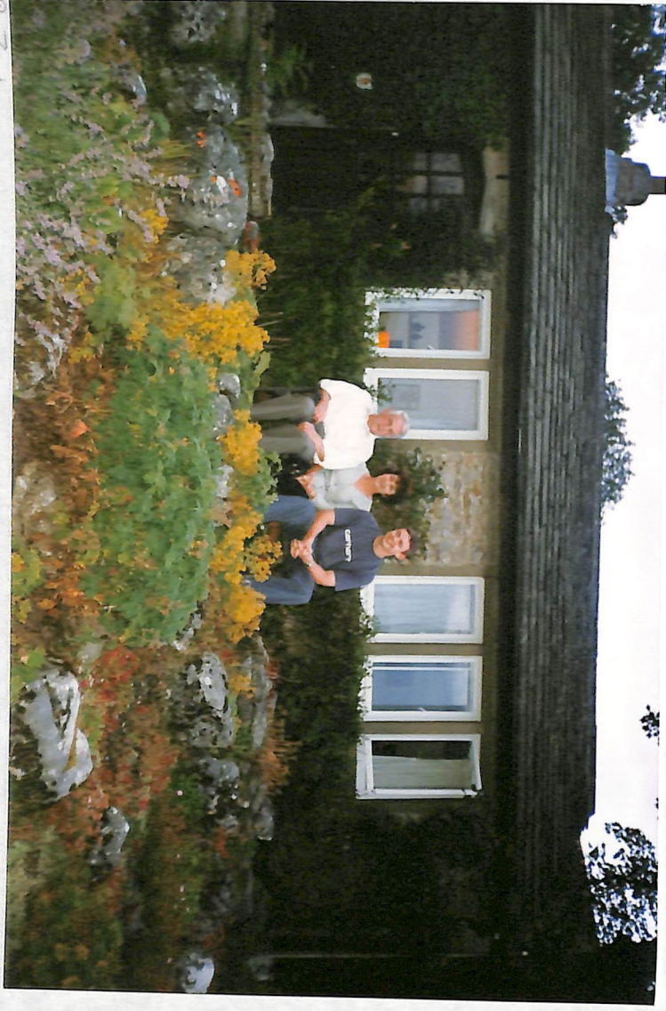
THE OLD SCHOOL AT LITTON