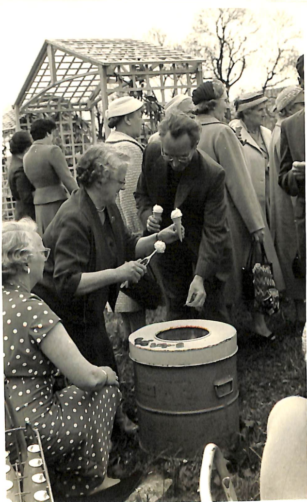
Rylstone Parish Church our Rector - Buying a Couple