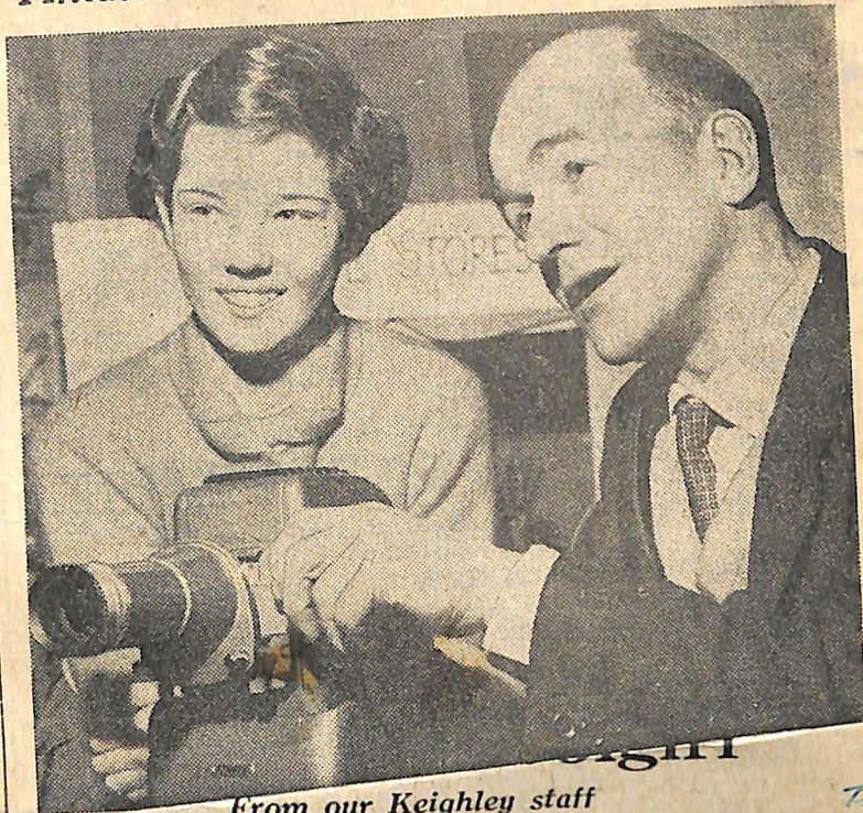
From our Keighley staff