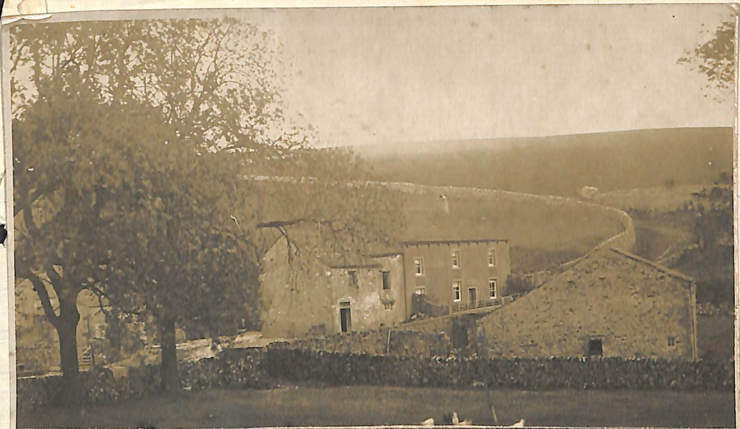
Bordley Town. Yorks.