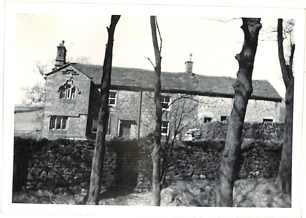
Lauinger House Bordley.