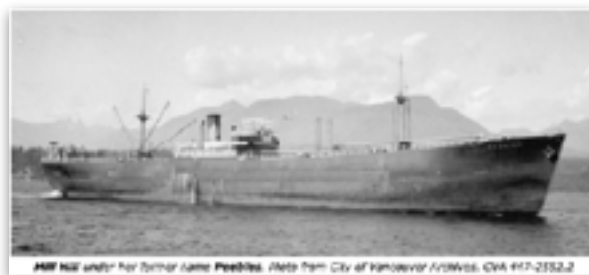
SS Mill Hill under her former name Peabody.