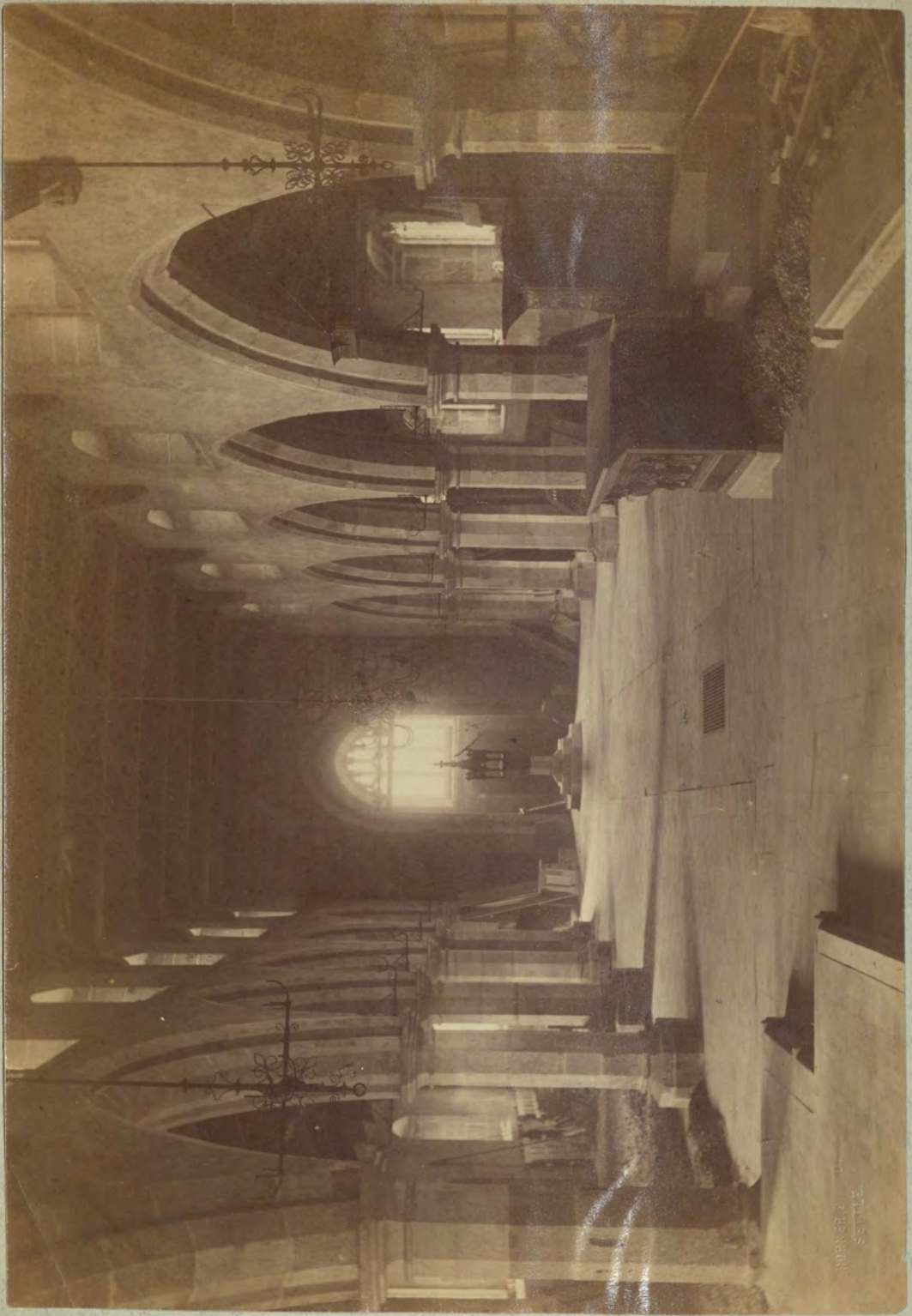
West End before Restoration completed.