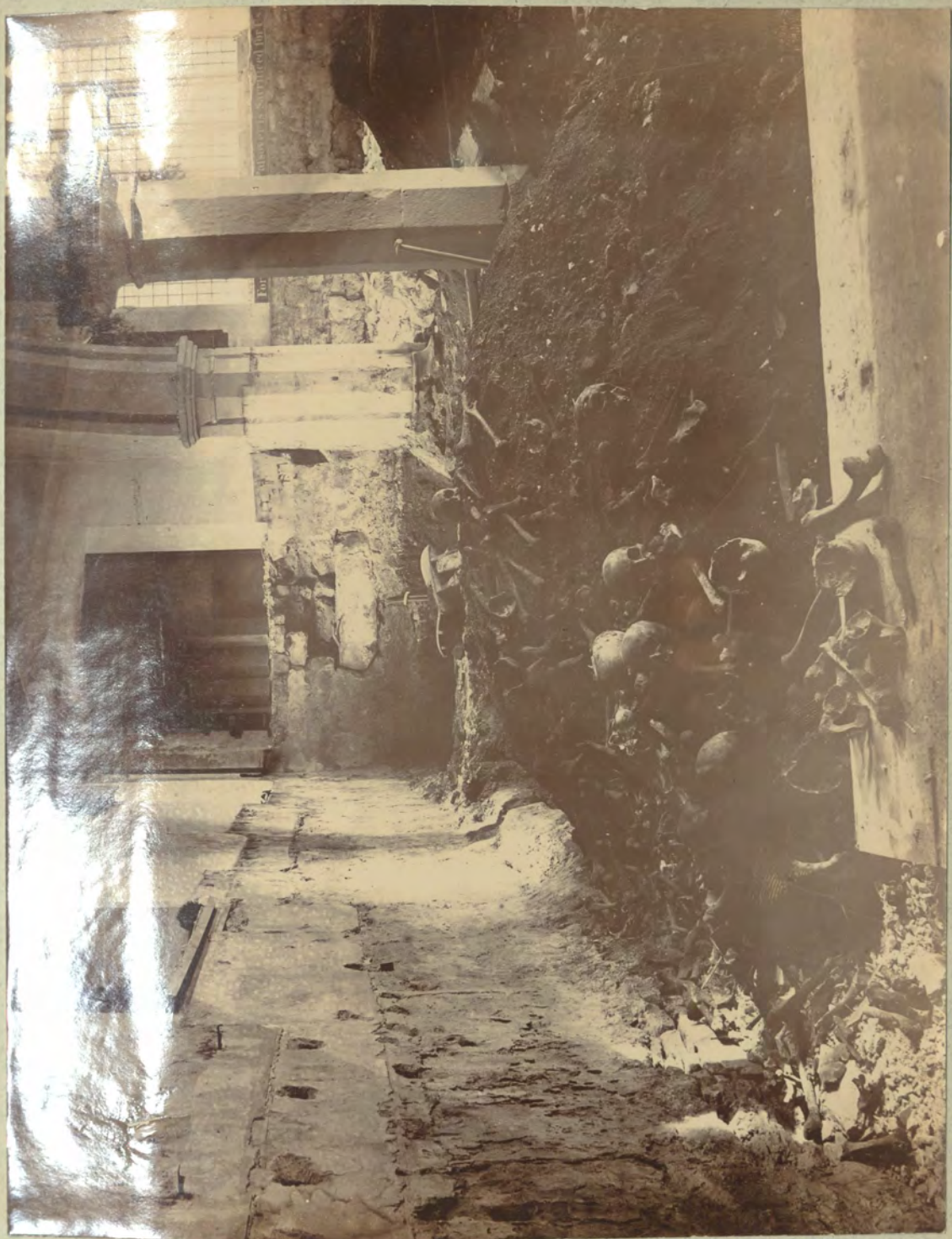
East End of the N. S. aisle during the work of Restoration. The bones were re-interred outside the Church