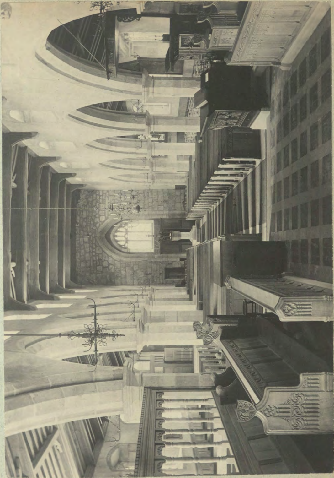
West End after Restoration.