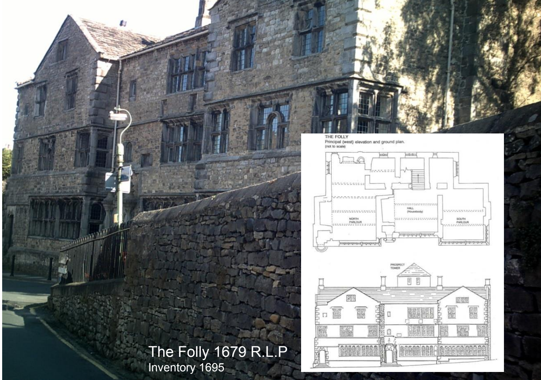
The Folly 1679 R.L.P Inventory 1695