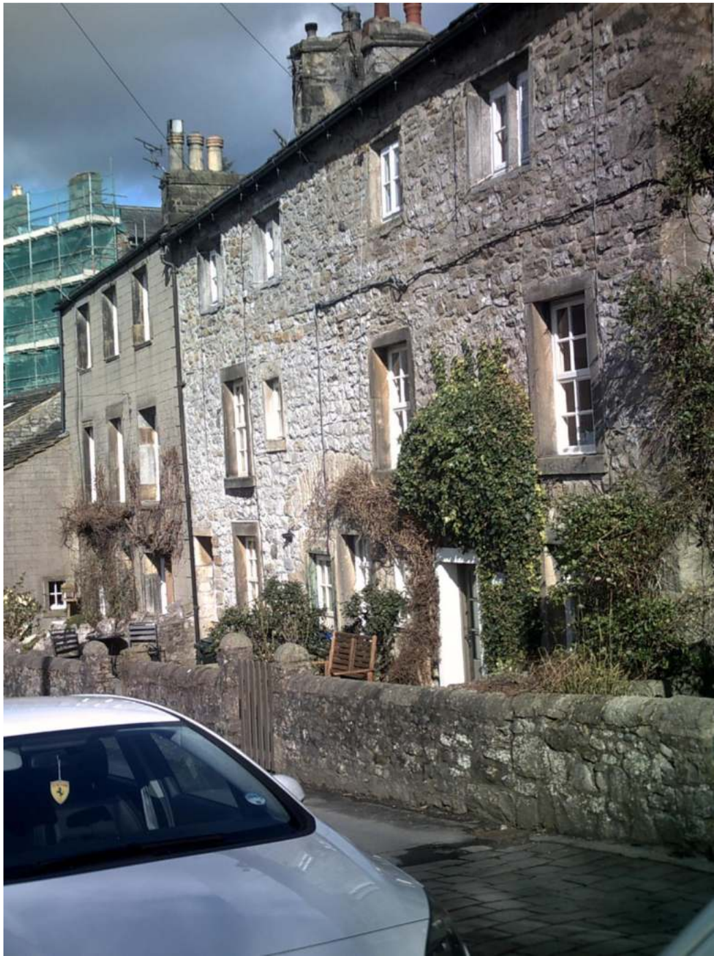
The old main road into Settle