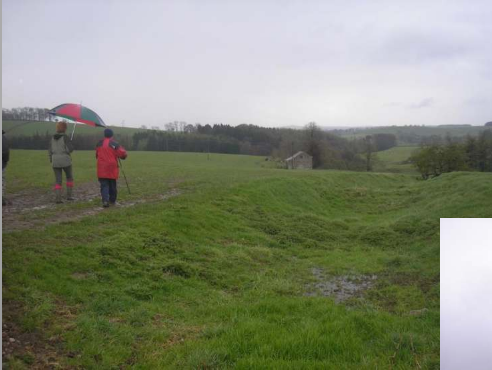
Mill Gate Laithe