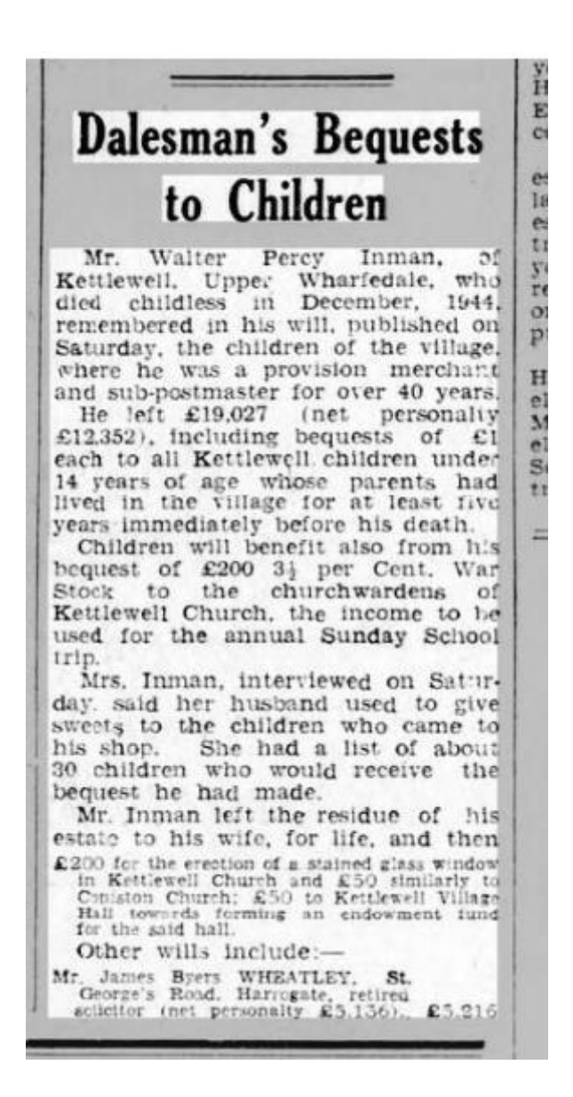
Yorkshire Post and Leeds Intelligencer 06 May 1946