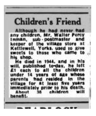
Lancashire Evening Post 04 May 1946