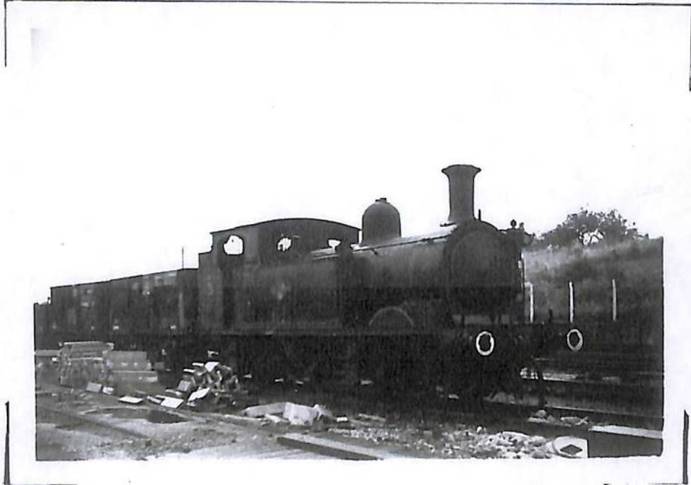
I.O.W. No. 31 0-4-1 STANDS IN THE YARD AT ST. JOHN'S. 1967. ⊗