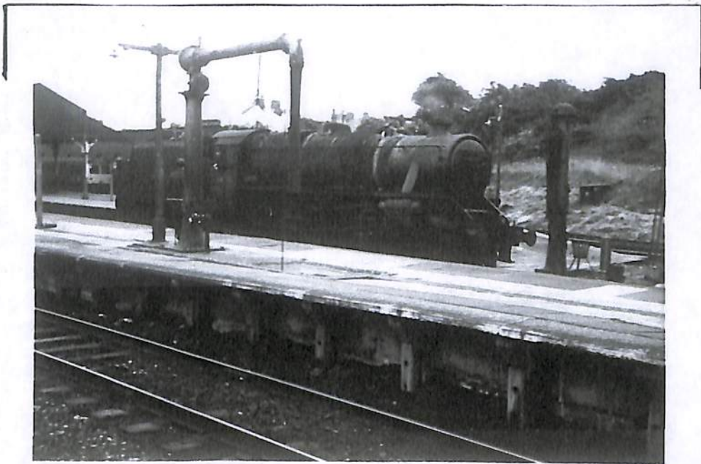
44735 RUNS LIGHT DOWN THE MAIN LINE JULY 13th 1968 CARNFORTH