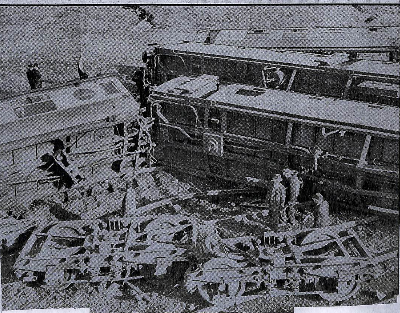
This picture, taken from a water tower nearby, shows how the force of the impact, as the express left the metals in yesterday's crash at Blea Moor, ripped the bodywork of some of the coaches completely from their bogies.