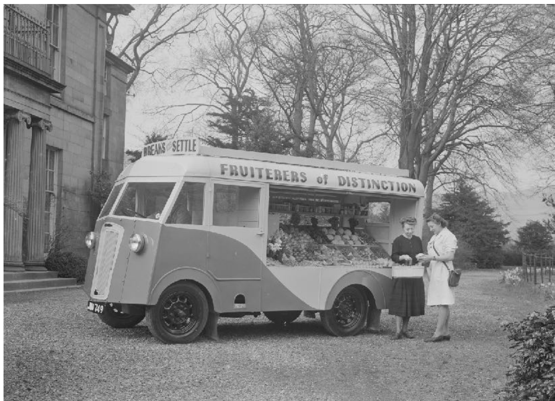
Breaks Fruit Van