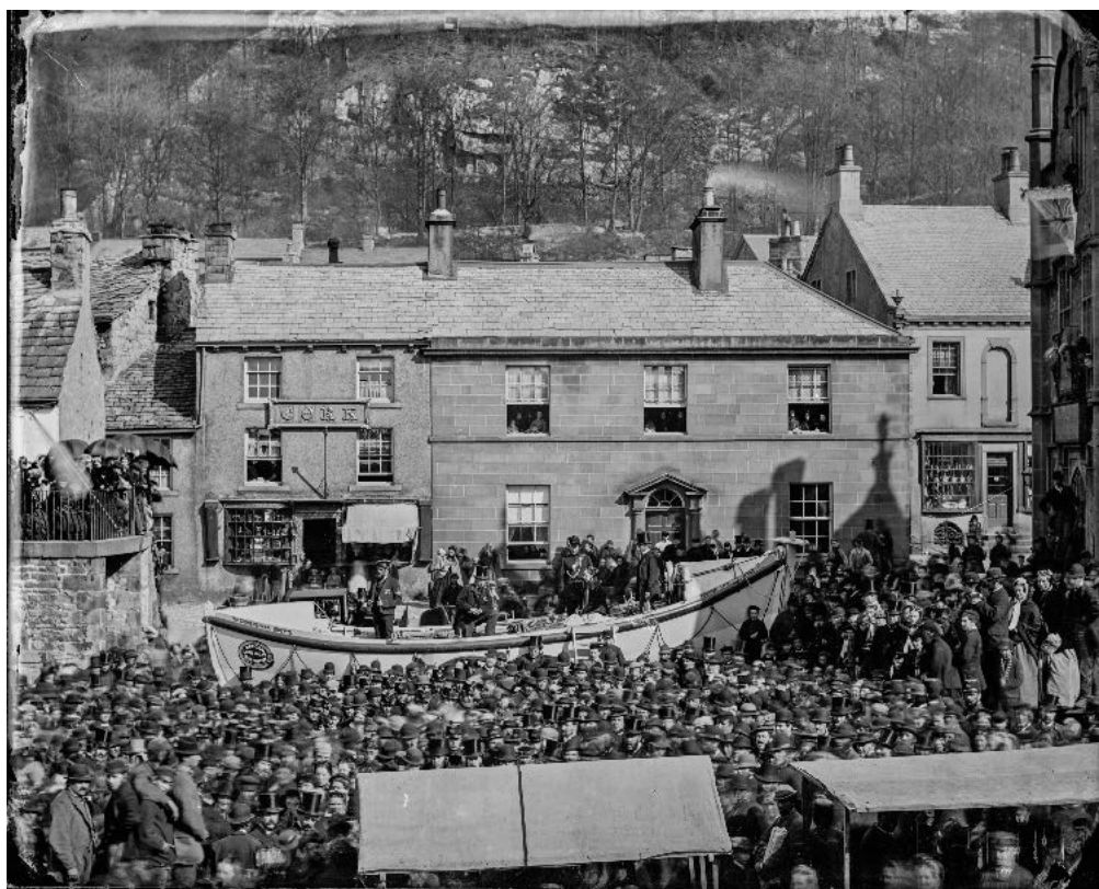
Settle Market Place, Lifeboat week