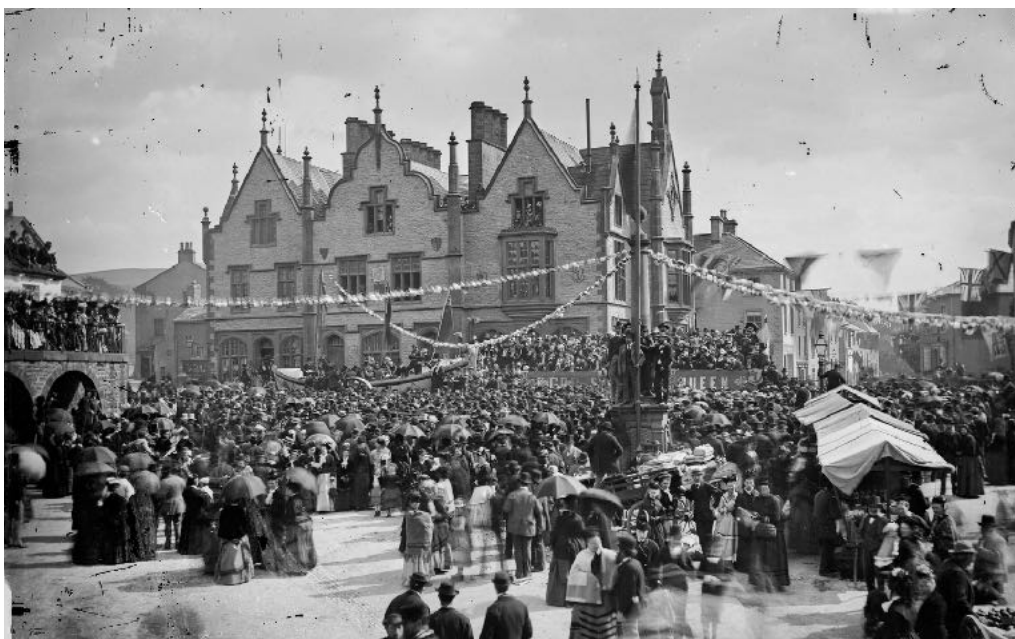
Settle Market Place, Lifeboat week

of rejoicing and celebration and the warm spring sun shone beneficially down upon a throng of top hats with enormous feathers, Billycocks (Bowler hats), bustles and leg of mutton sleeves.’ That evening a fundraising concert was held in the Music Hall (Victoria Hall). This lifeboat was based at Penmon, Anglesey and operated on the coast of North Wales. A model of the Christopher Brown, together with commemorative memorabilia and postcard, provides more detail [ph3].