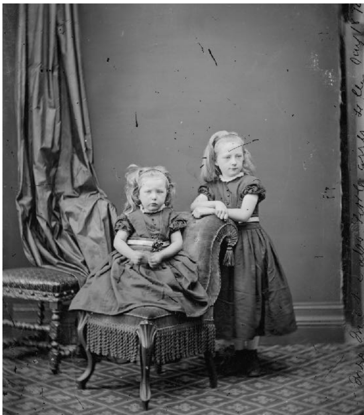
Mrs Metcalfe's little girls, photograph by the Horner Studio. Horner Collection©NCBPT (CC-BY 4.0)