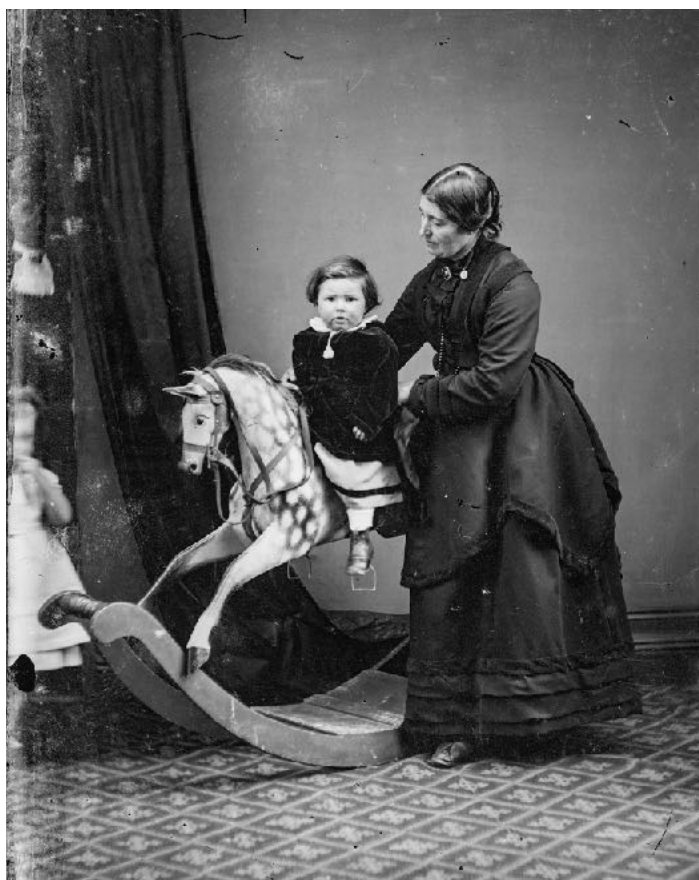
Mrs Shepherd and little boy 1872, photograph by the Horner Studio. Horner Collection©NCBPT (CC-BY 4.0)