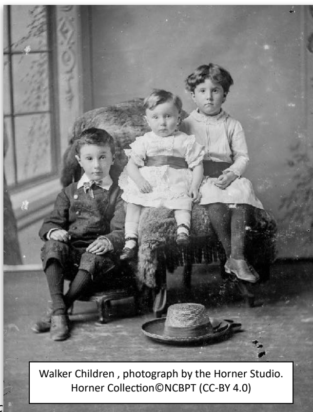
Walker Children , photograph by the Horner Studio. Horner Collection©NCBPT (CC-BY 4.0)