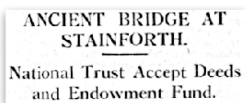
Stainforth Bridge (Pack Horse)

introduction of cars caused a significant increase in 'wear and tear' to the bridge, beyond Thomas' means and so he decided to donate the bridge to the National Trust.