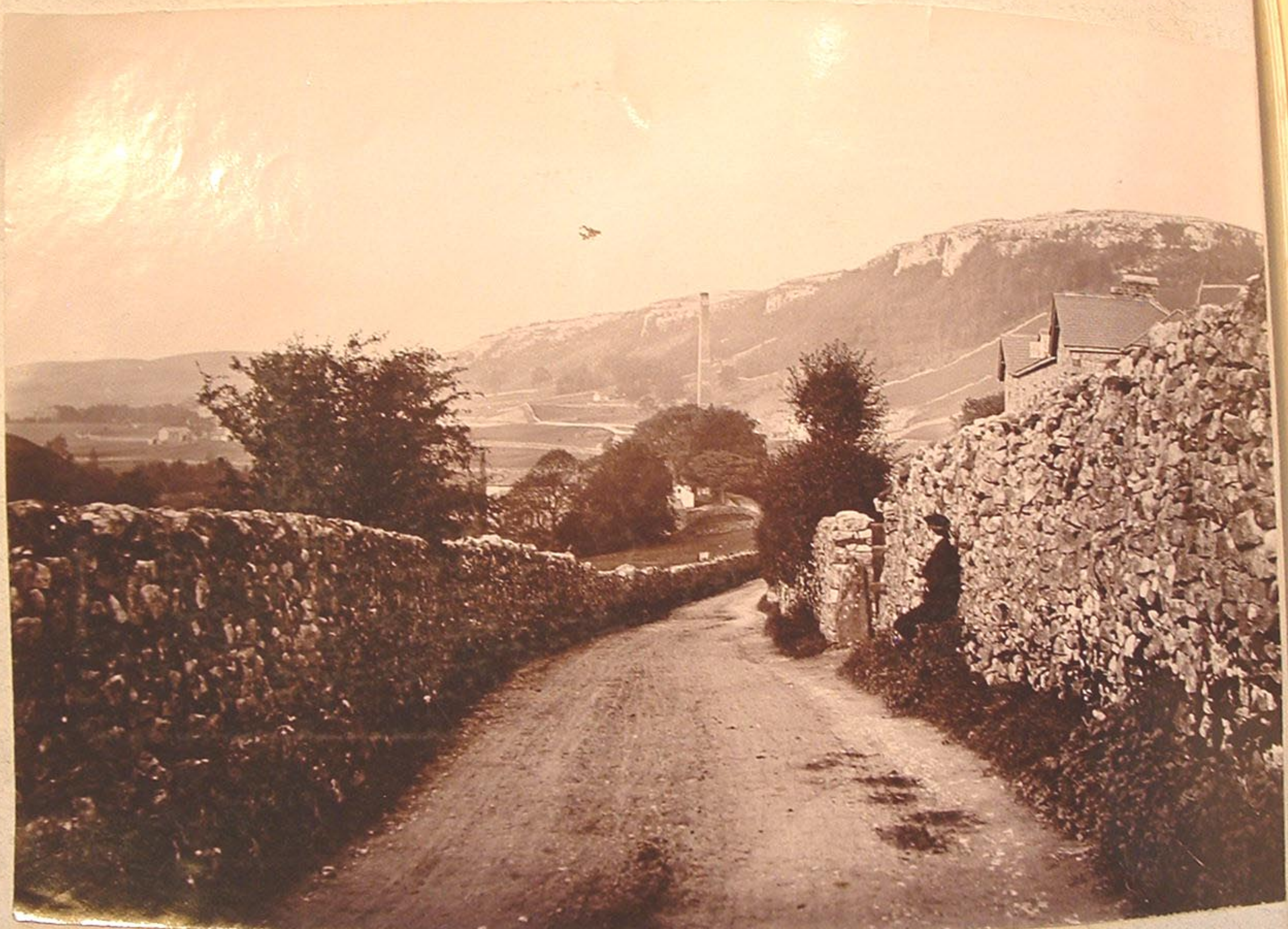
Road between Laugeliffe and Stainforth..