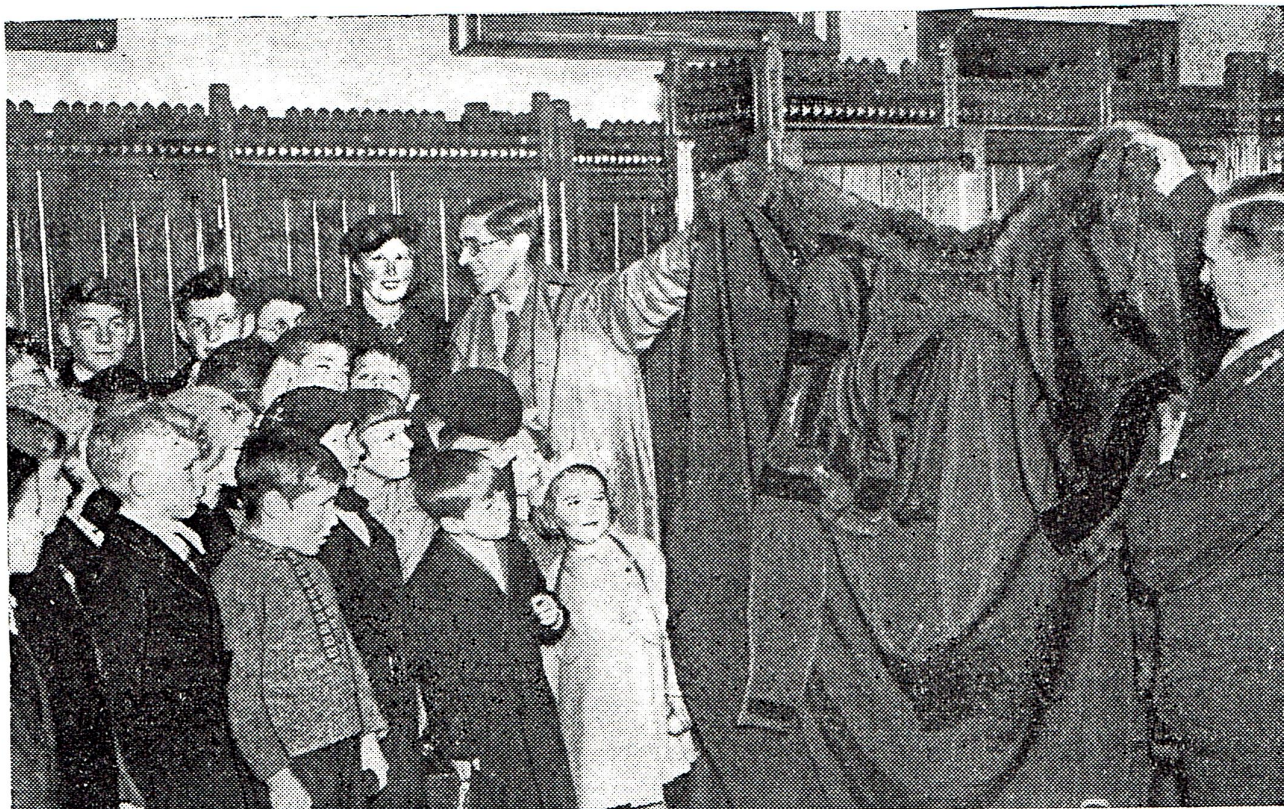
A CIVIC LESSON.—Some of the 35 children of Langcliffe Council School, Settle, being shown the Lord Mayor's robes during their tour of Bradford Town Hall.: (By a "Mercury" photographer.)