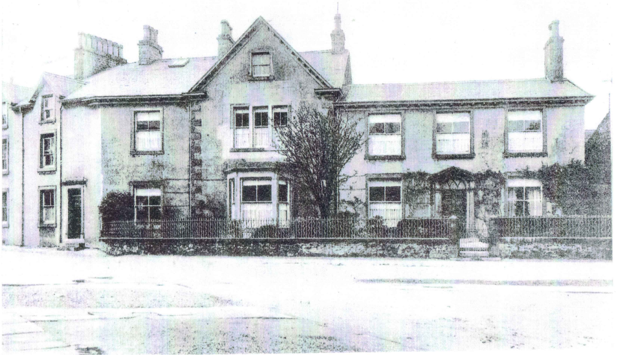
GIRLS SECONDARY SCHOOL, SETTLE.