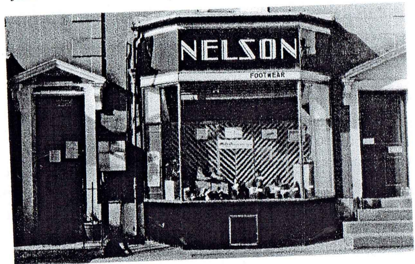
The Art Deco shopfront in Duke Street, Settle