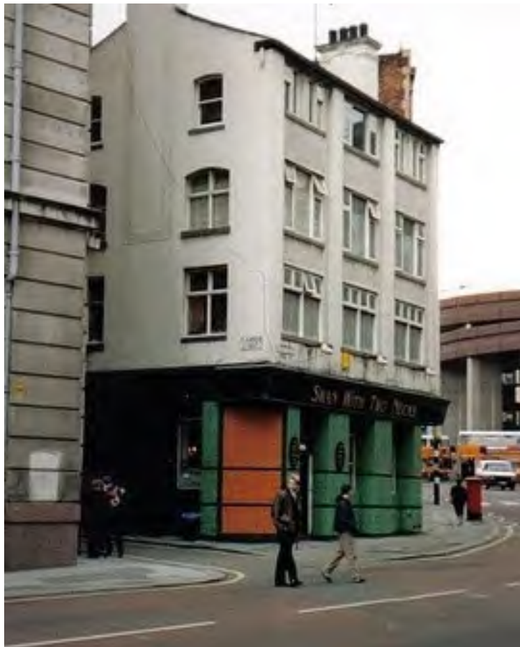
The Swan with Two Necks, Withy Grove, Manchester

The Secretary was instructed to make enquiries of suitable establishments, The Swan with Two Necks (Withy Grove) being reported as possibly suitable”