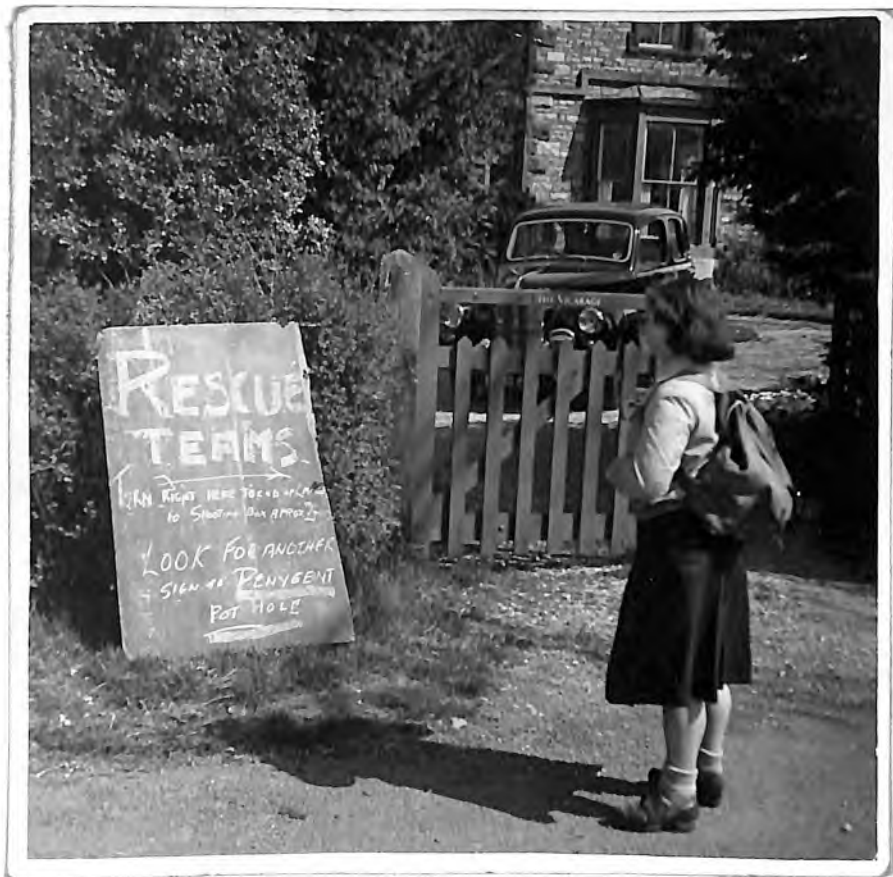
Photograph taken outside the Vicarage at Horton on Whit Sunday, 1951 giving instructions to Penyghent Pot, where a young man from Holywell had lost his life.