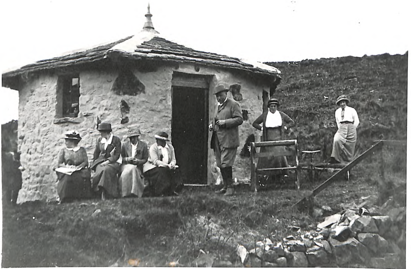
These pictures are of two shooting lodges. The round one is Turpin Hut at Swarth Gill (now in ruins) and the other was known as the Crystal Palace and was on Scale Moor.