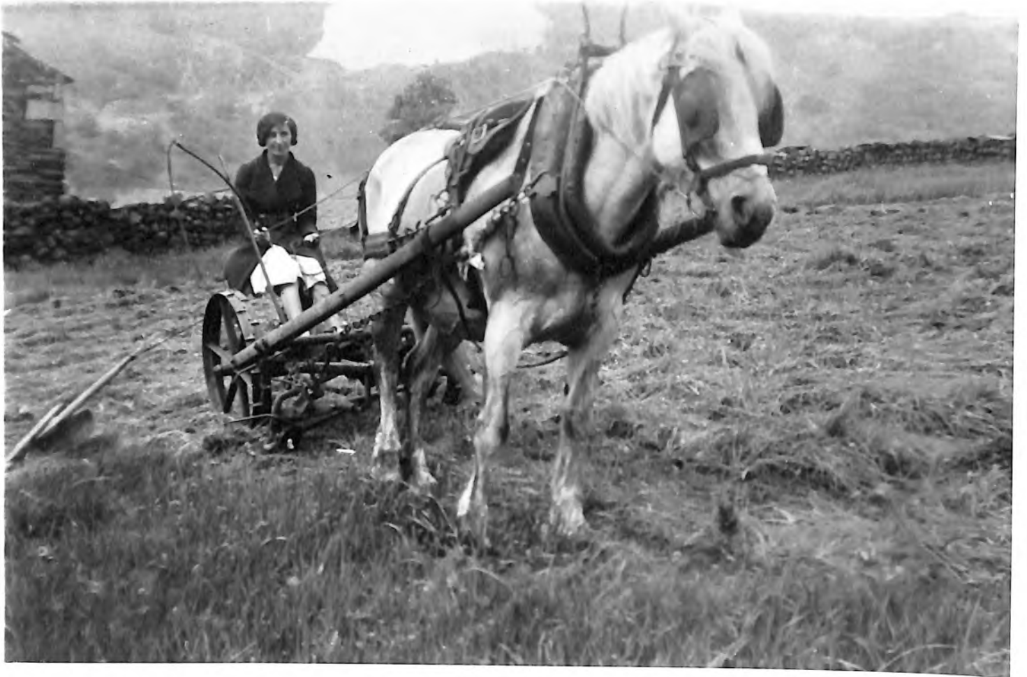
Mrs Staveley driving the horse drawn hay cutting machine at Arcow farm in the 1940's