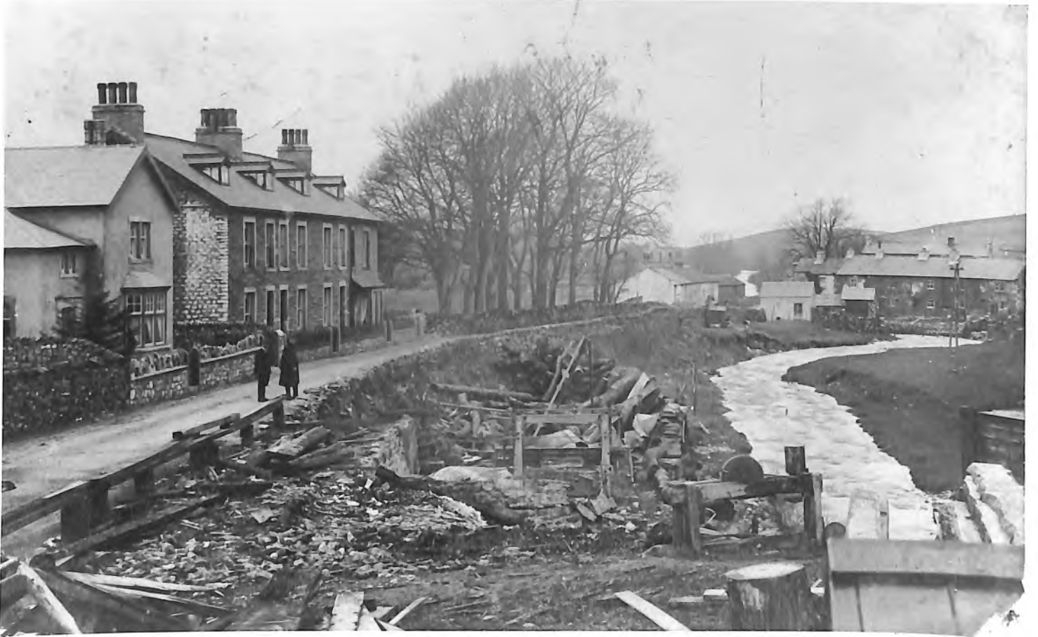
Brantsghyll Terrace and South View, Horton before water-wheel, and Village Hall were built, pre 1926.