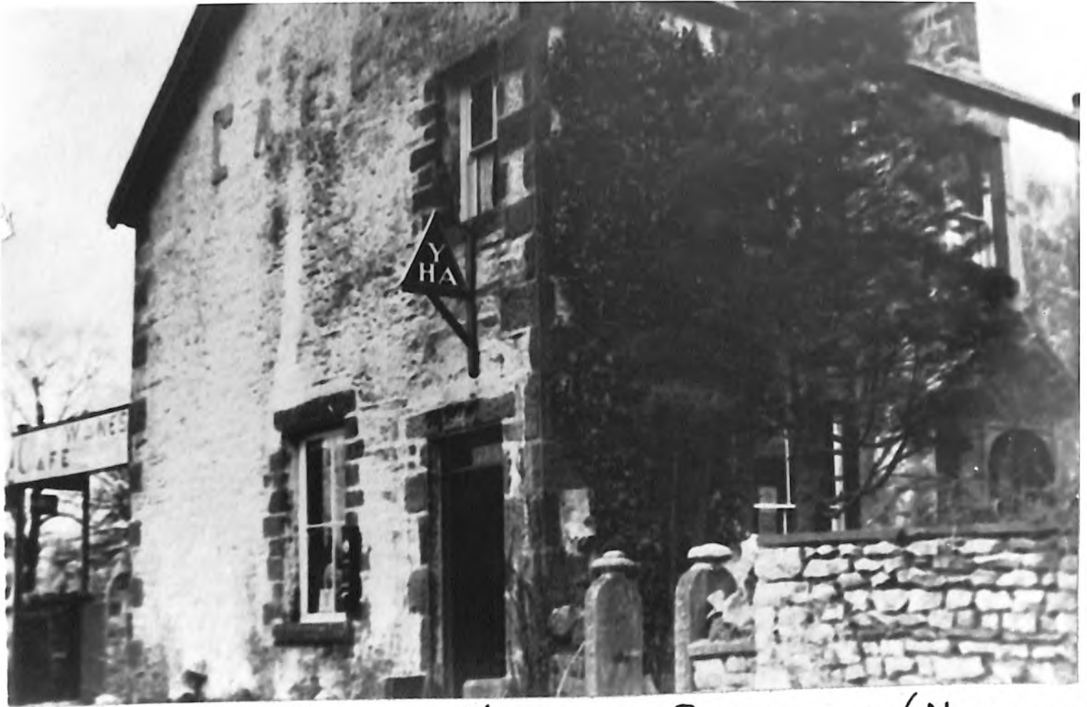
THE HOSTEL, HORTON-IN-RIBBLESDALE. (NOW CLOSE

The Youth Hostel at Horton in Ribblesdale, circ. 1920, which is now the Village Post Office.