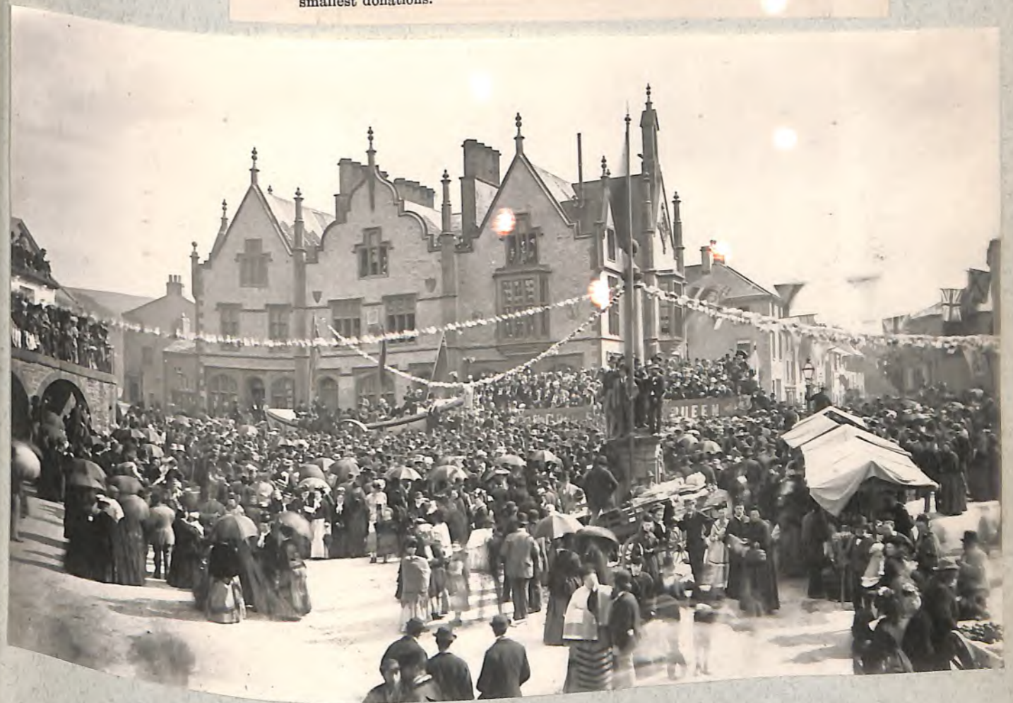
Presentation of the "Ellen and Margaret, of Settle" Lifeboat. 1875.