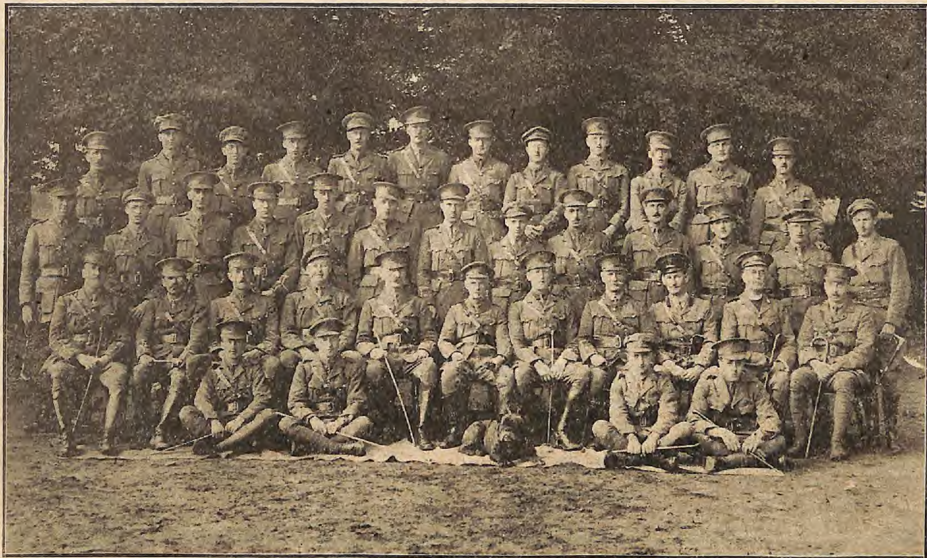
A group of the officers now at Babworth Camp, near Retford. The names (reading from left to right) are:—