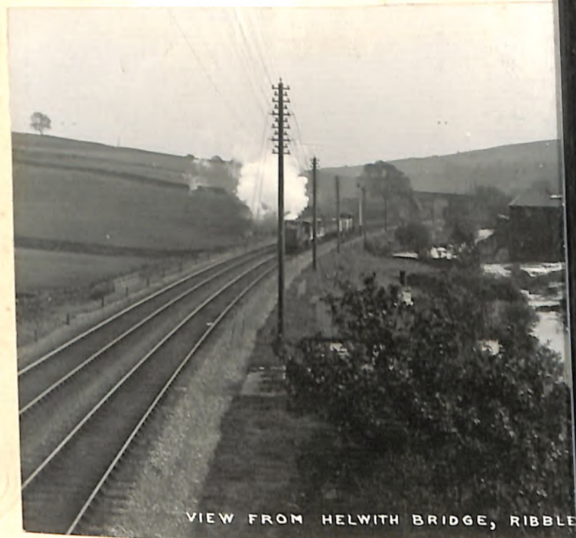
VIEW FROM HELWITH BRIDGE, RIBBLE

The Ribblesdale Lime & Flag Quarry Co., Limited, Helwith Bridge, near Settle,