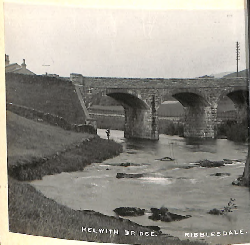
HELWITH BRIDGE. RIBBLESDALE.