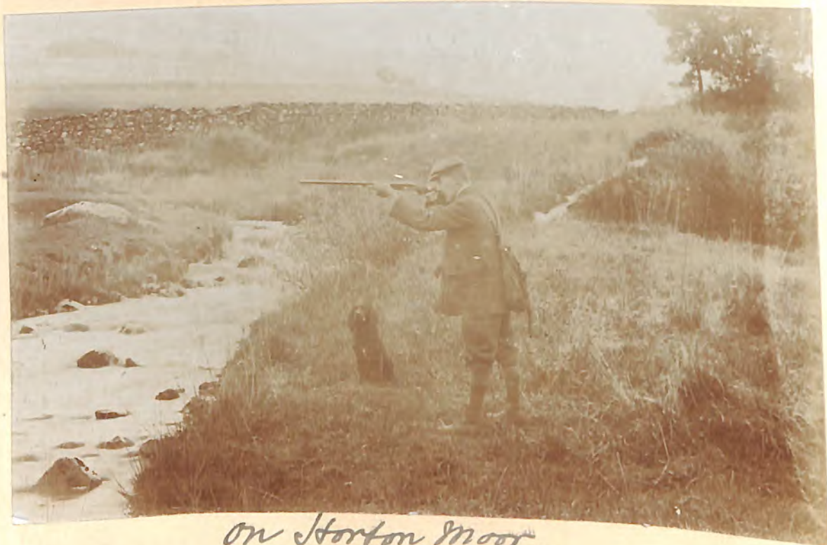
on Storton Moor.