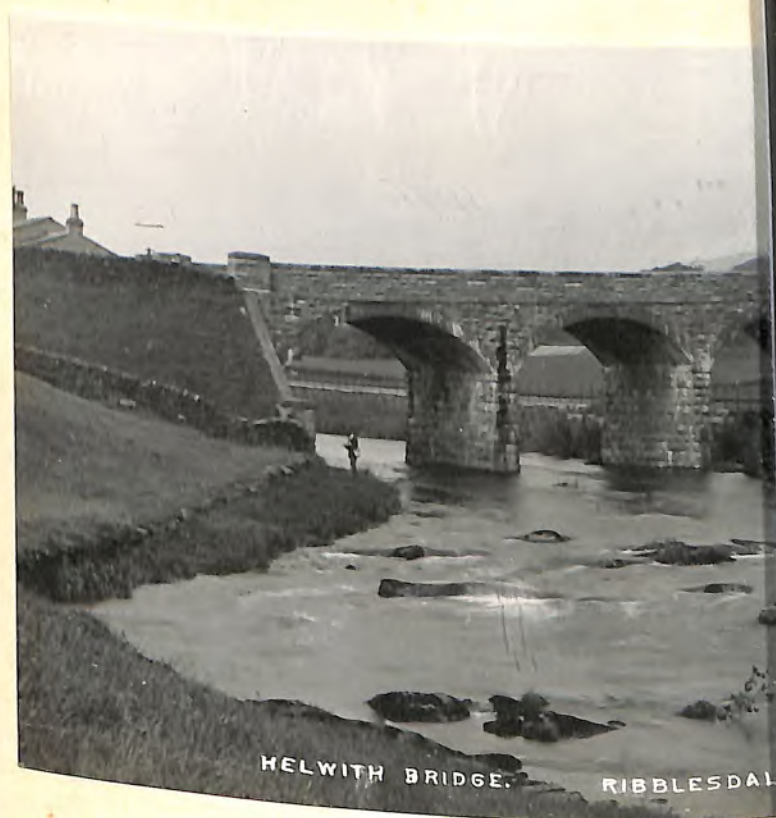
HELWITH BRIDGE. RIBBLESDALE