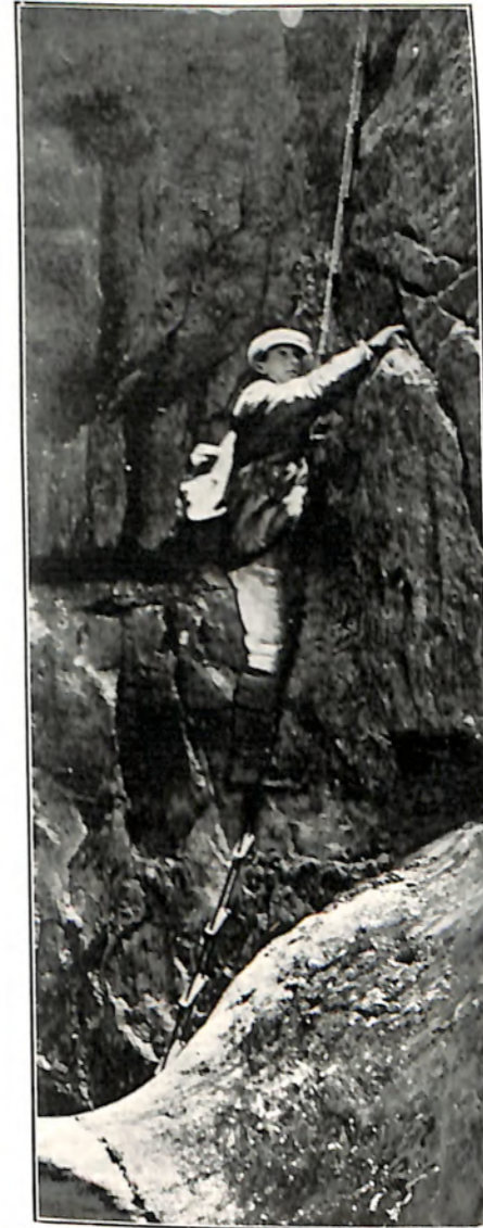
DESCENDING GAPING GHYLL HOLE. Opposite ledge 190 feet from top—150 feet from bottom.