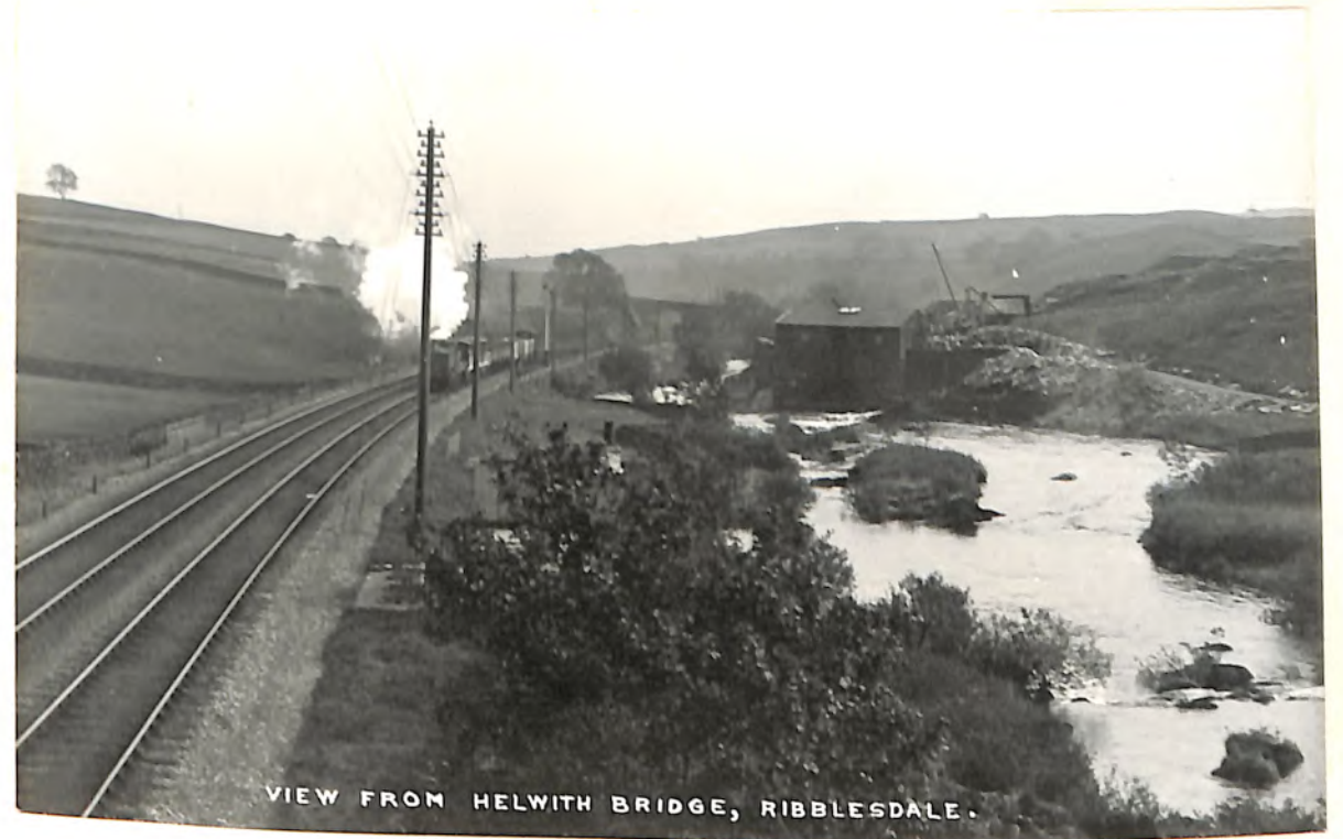
VIEW FROM HELWITH BRIDGE, RIBBLESDALE.