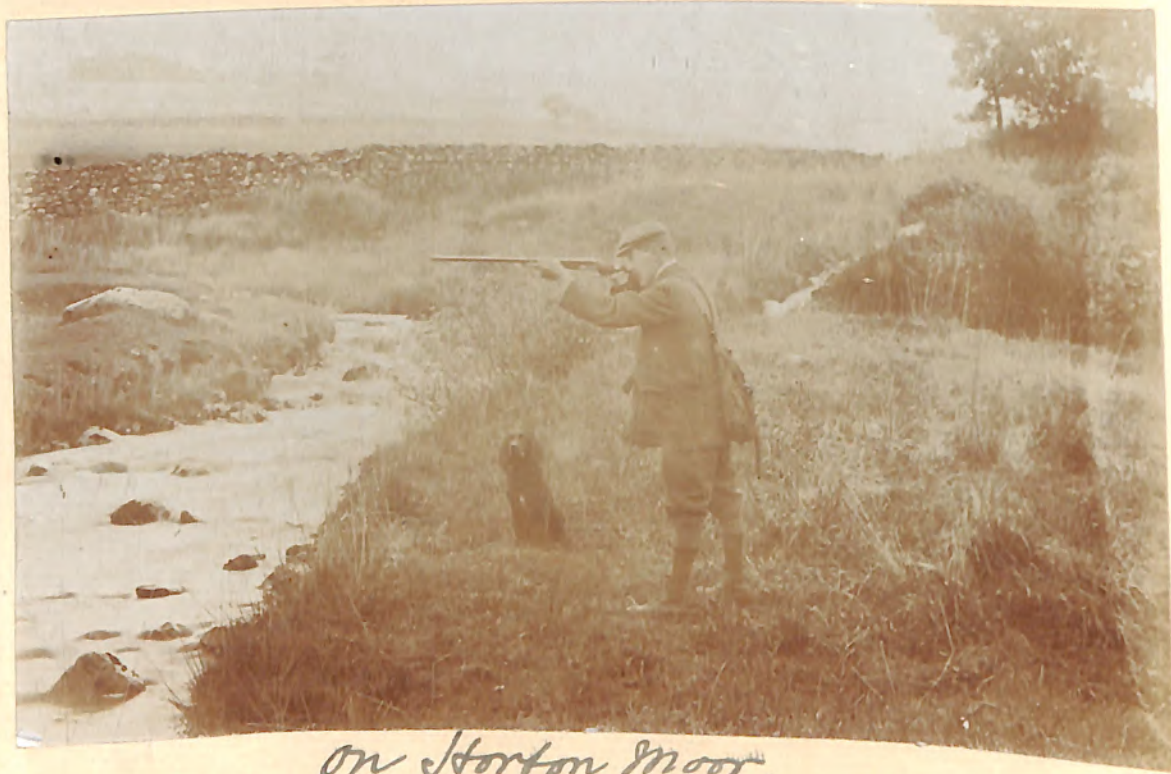
on Storton Moor.