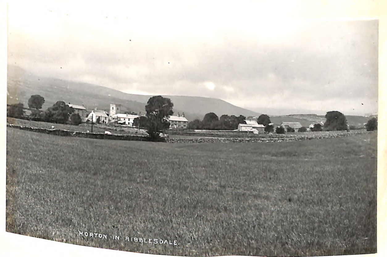
HORTON IN RIBBLESDALE.