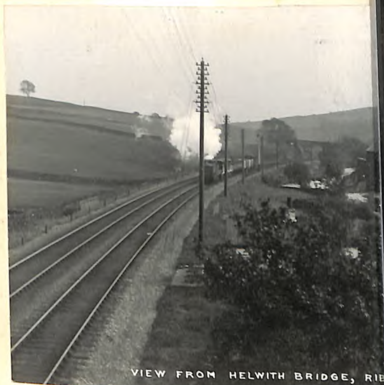
VIEW FROM HELWITH BRIDGE, RIB