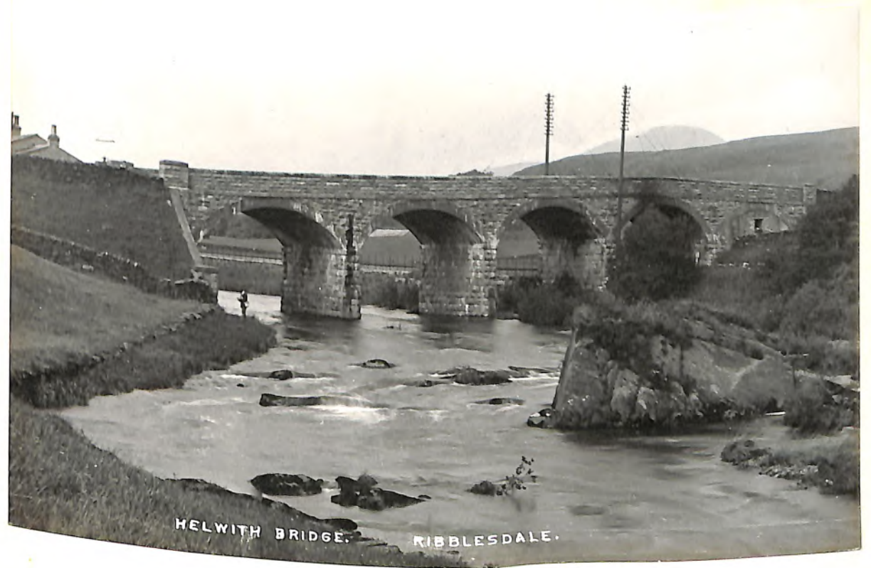
HELWITH BRIDGE. RIBBLESDALE.

DE ABLE SPE E D CURE THA from opium given for a proved in n in a wine-glas ELY BY