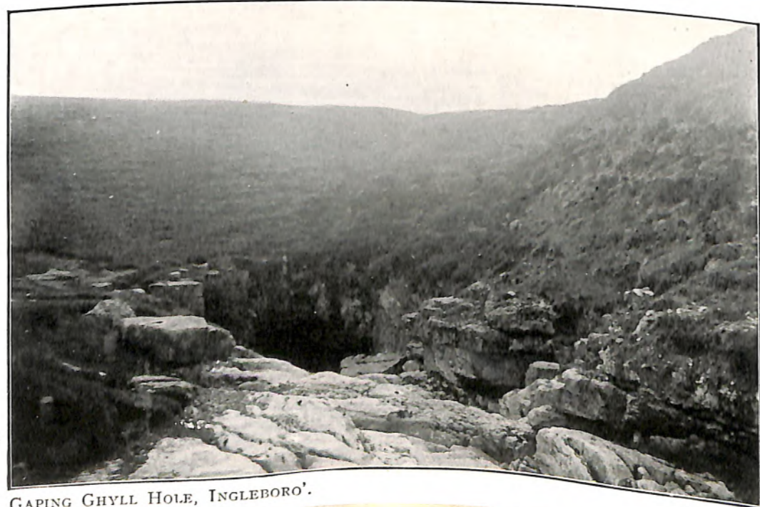
GAPING GHYLL HOLE, INGLEBORO'.