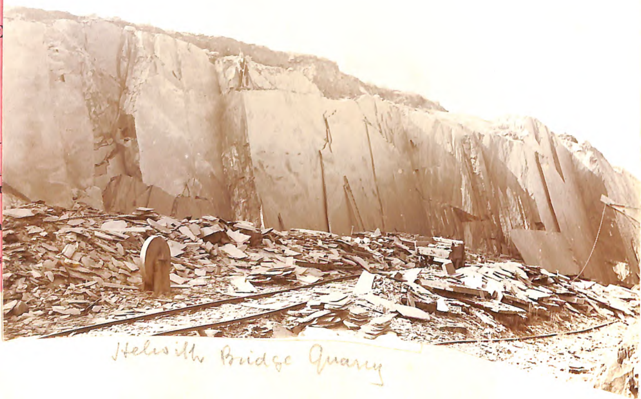
Helwith Bridge Quarry

DE ABLE SPE E D CURE THA from opium given for a proved in n in a wine-glas ELY BY