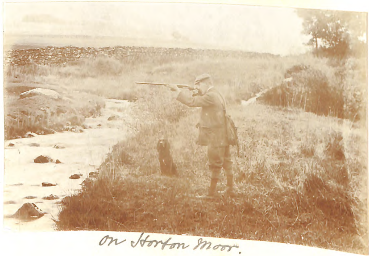
on Horton Moor.