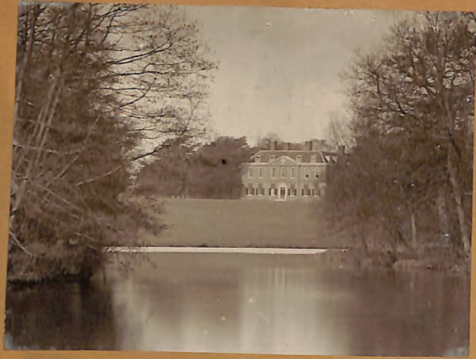
Ditchingham Hall, Norfolk. (Principal seat of the Carrs.)