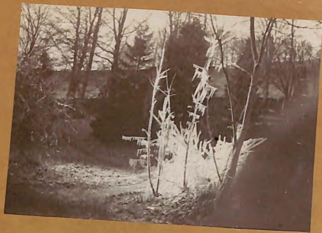
Frozen spray from the fountain.