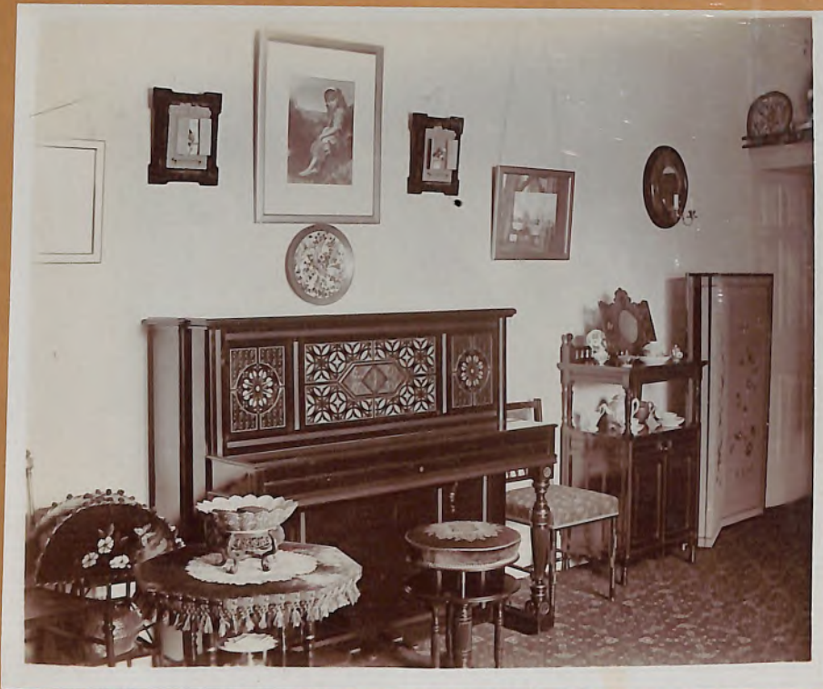
Drawing Room at Clark House