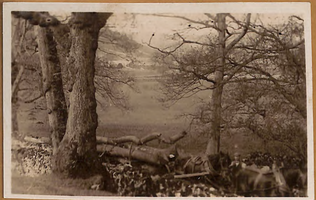
Cutting trees down Stackhouse Lane.