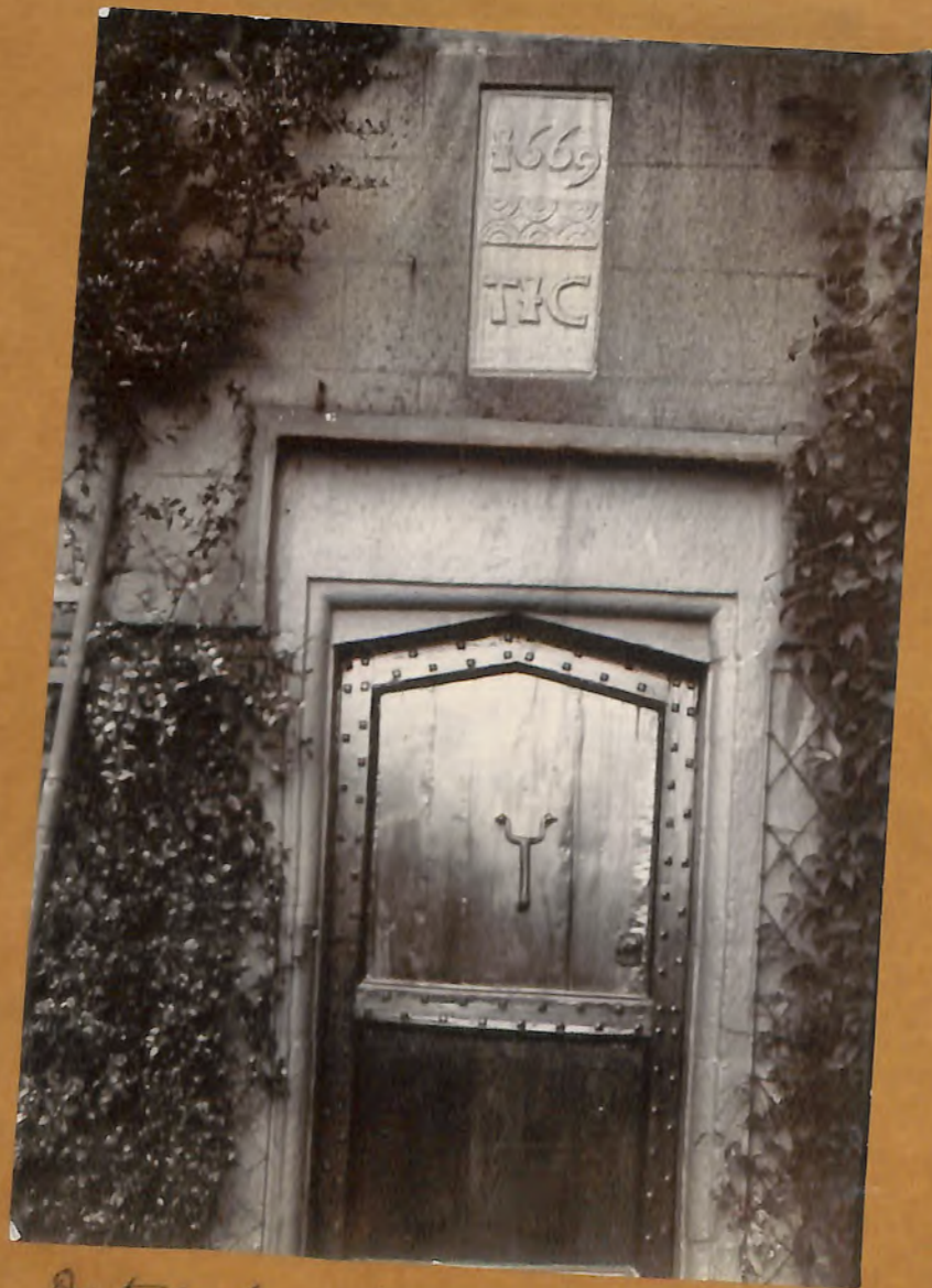
Dated over-head at "farrholme."