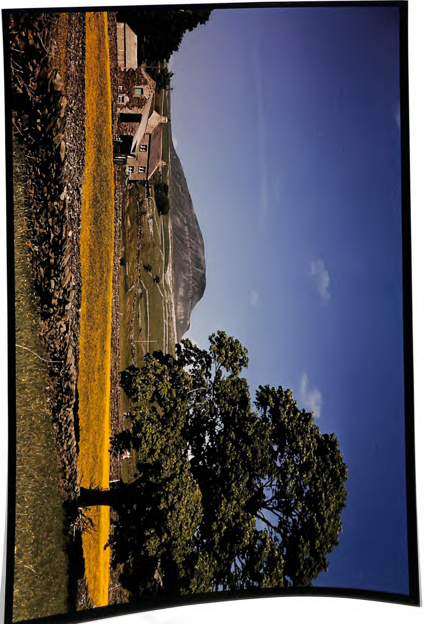
Southern end of Horton Parish, showing Penyghent.