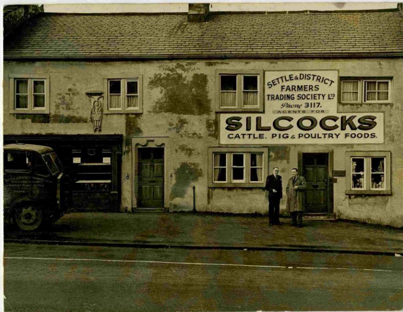
NAKED MAN CAFE AND SHOP SETTLE AND DISTRICT FARMERS 1950s