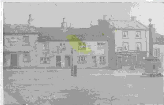
NAKED MAN SETTLE AND DISTRICT DAWSONS FARMERS