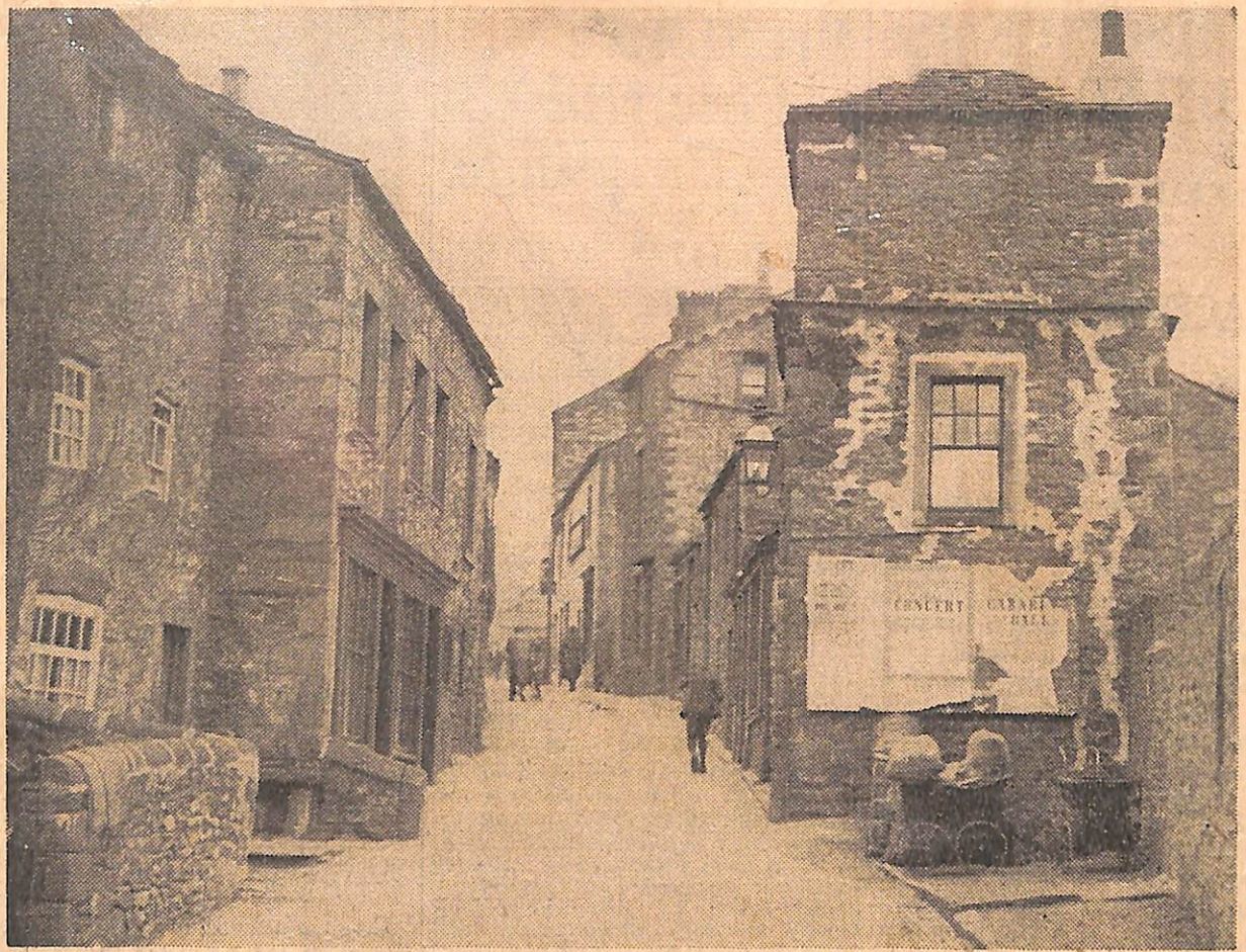
Settle possesses many picturesque vistas apart from that obtained from the Market Place and which is well-known to all the road fraternity. The spot depicted above may be reached by turning right at the Town Hall and ascending past the beautiful 17th century house known as the "Folly."

Picture by YORKSHIRE OBSERVER NEWSPAPER AUGUST 12TH 1932. Magson