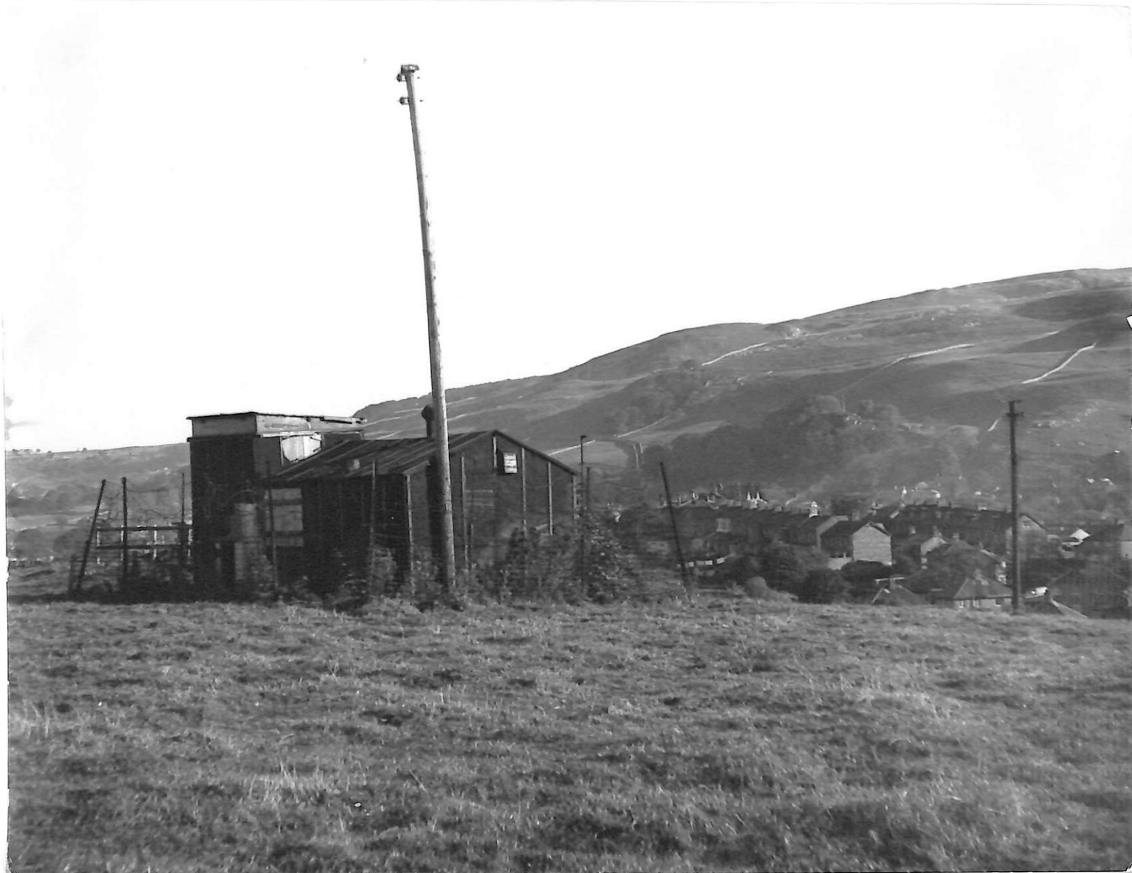
ROYAL OBSERVER CORPS STATION NOW PENNY GREEN CAMMOCK LANE SETTLE 1972