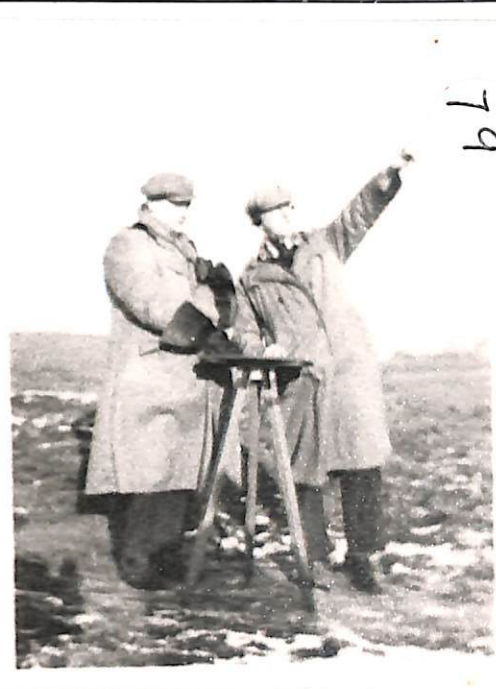
SETTLE WARTIME ROYAL OBSERVER CORP CREW 1939 - 45