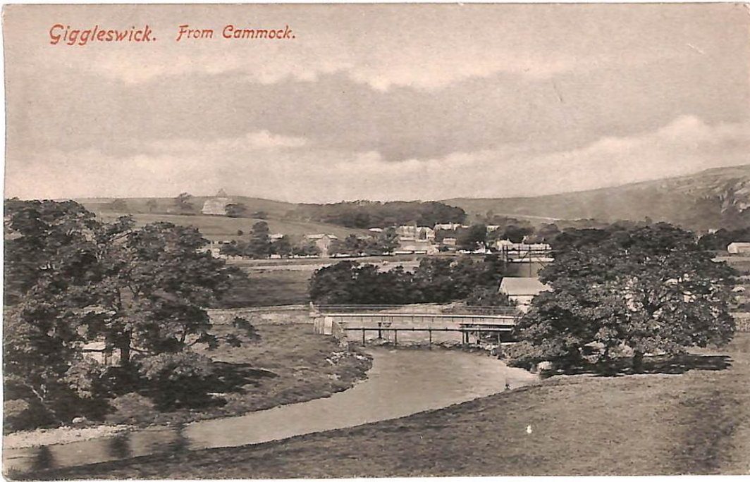
GIGGLESWICK FROM CAMMOCK