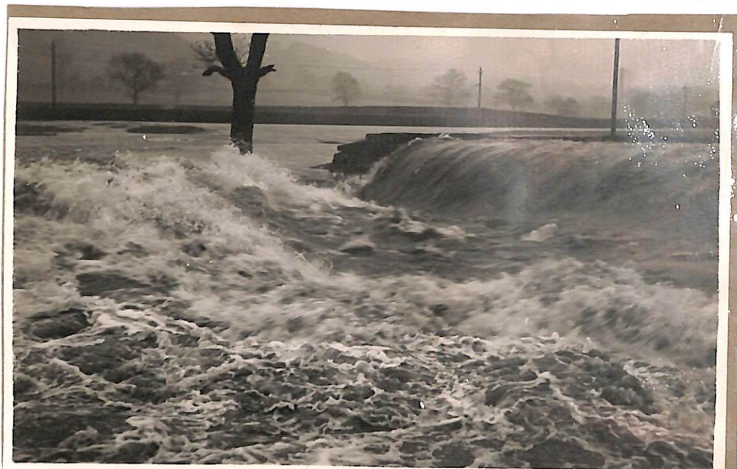
RIVER RIBBLE FEB 16TH. 1935 SETTLE BRIDGE END.