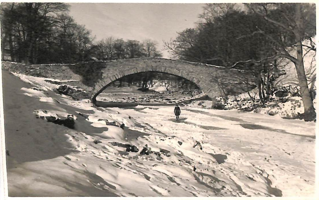
STAINFORTH BRIDGE 1940 HIGH FELL AND WARNDALE KNOTTS SETTLE