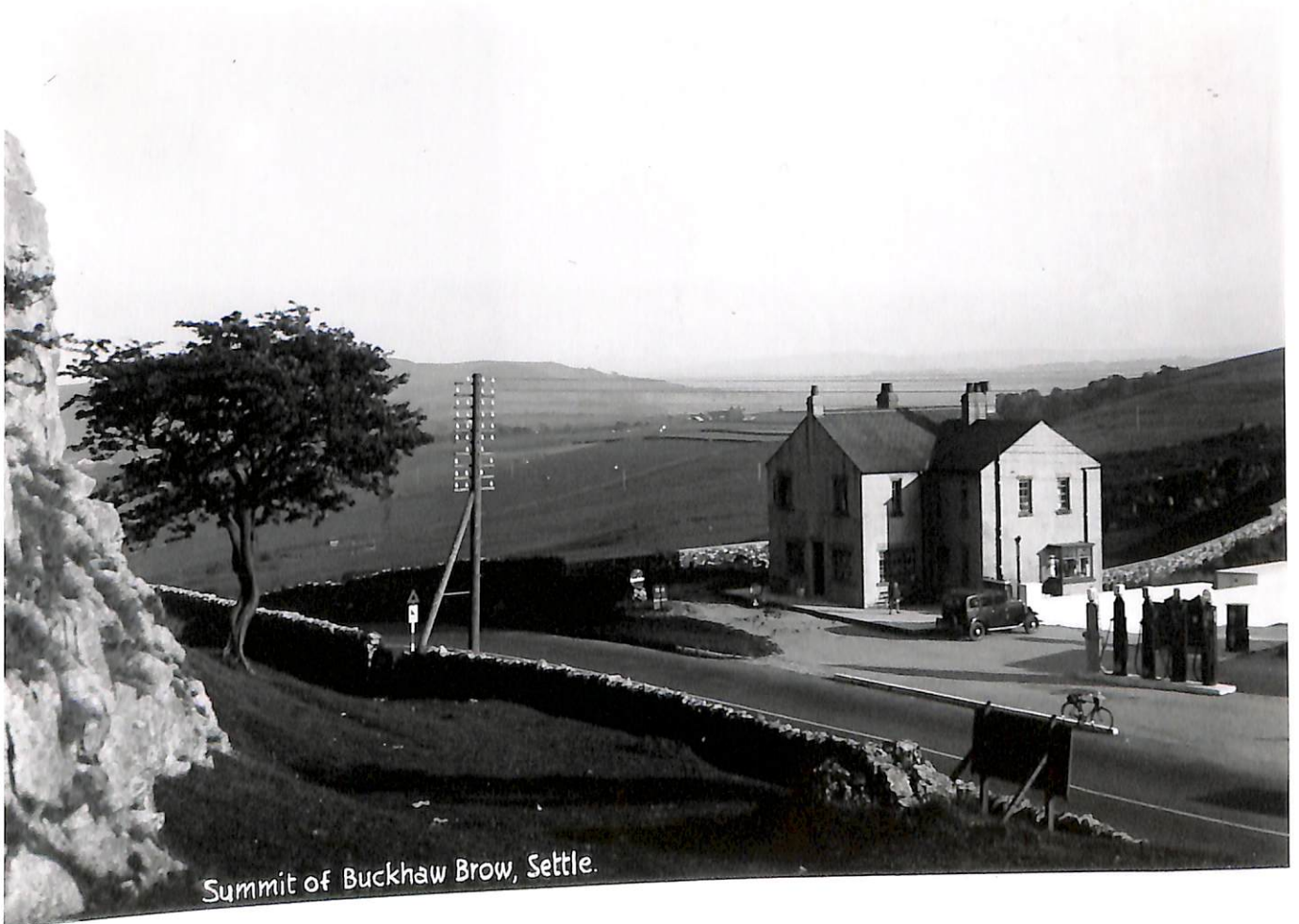
Summit of Buckhaw Brow, Settle.