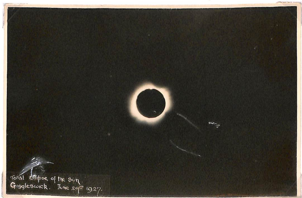
Total Eclipse of the Sun Giggleswick. June 29 th 1927.