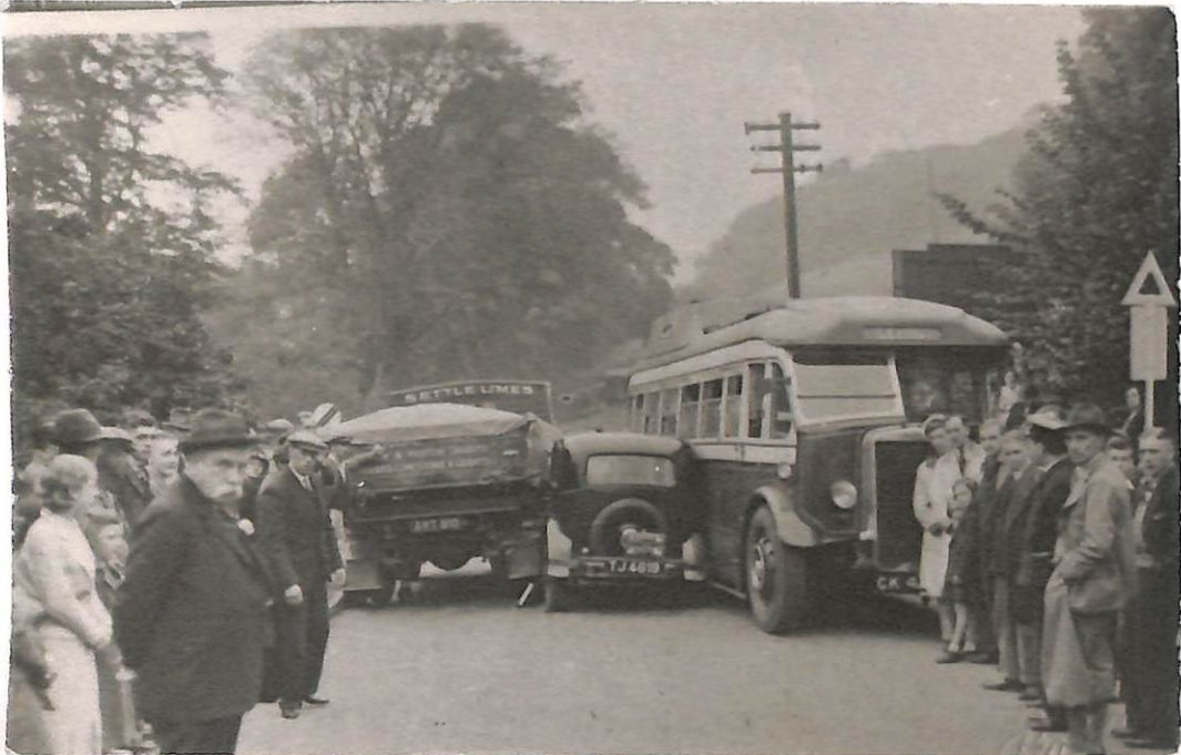
"TIGHT SQUEEZE" TOP OF BELL HILL 1930'S