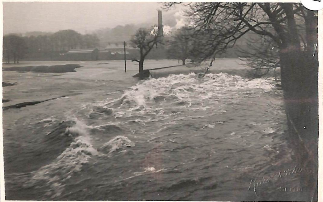
THE RIVER RIBBLE SETTLE FEB 16TH 1935