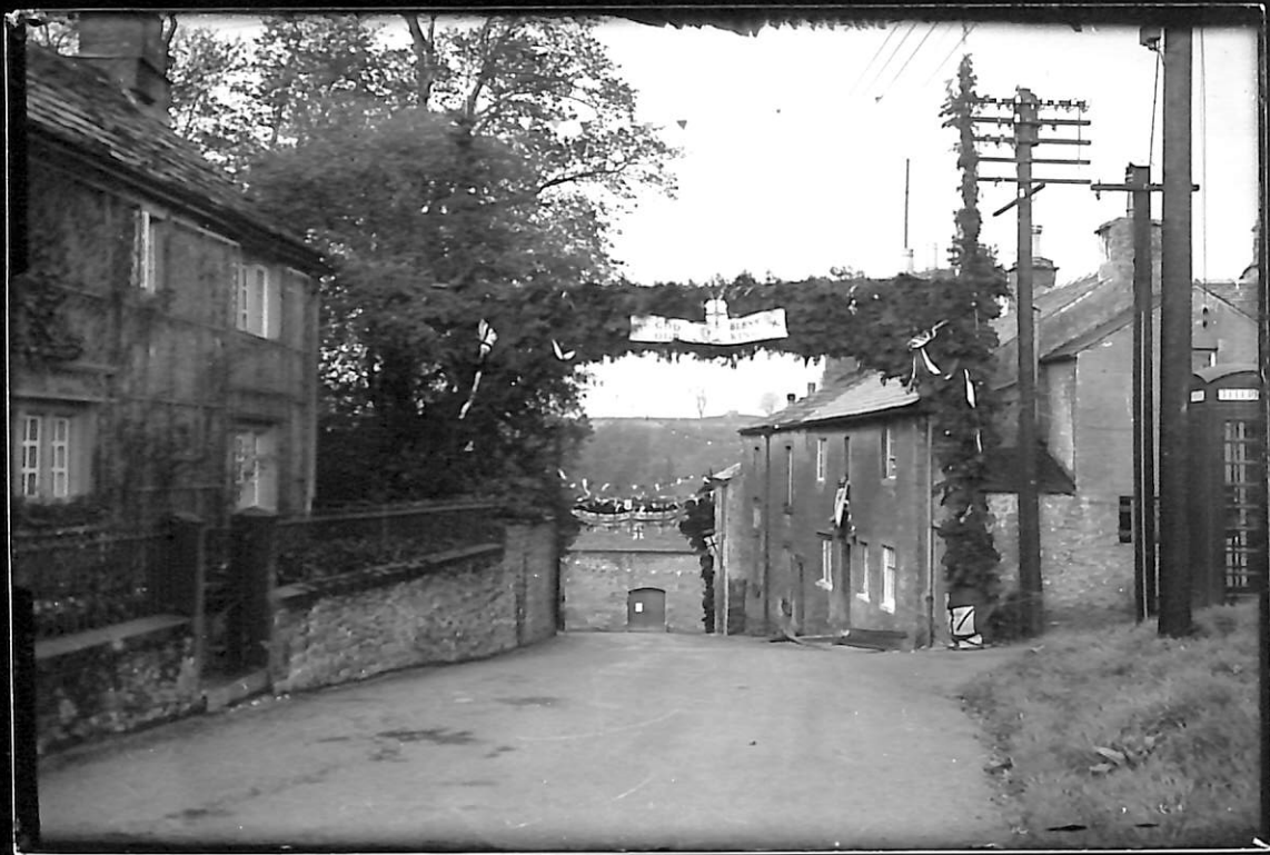
31. DECORATED ARCH - BELLE HILL, GIGGLESWICK