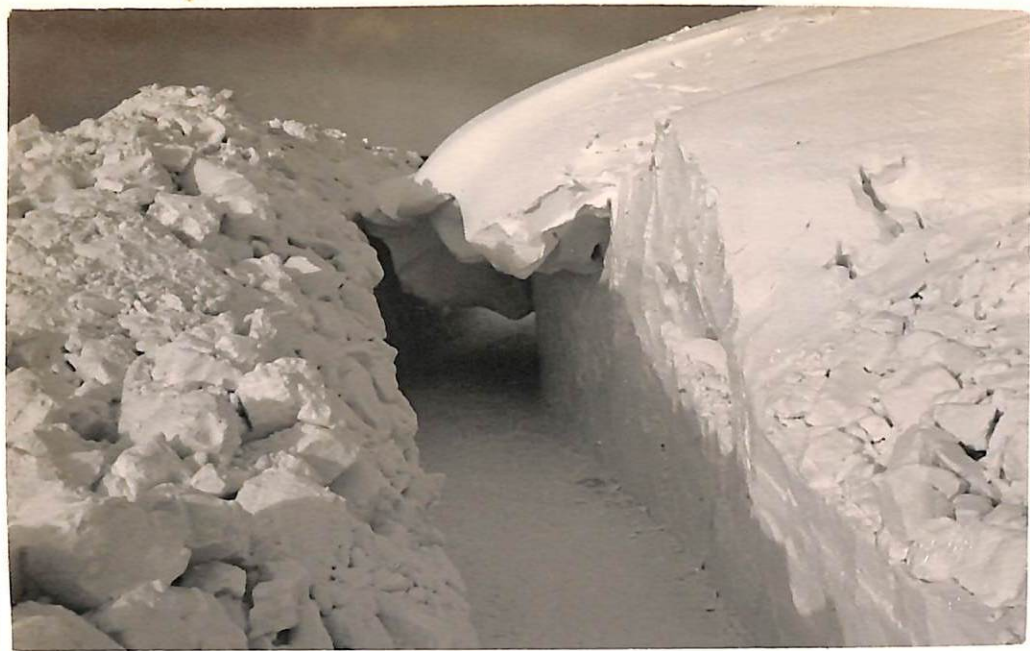
LANGCLIFFE TO MALHAM ROAD 1940