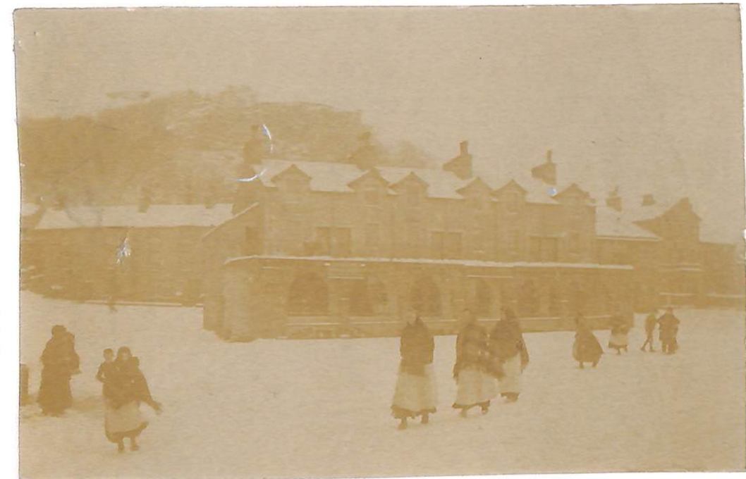
MILL GIRLS GOING TO WORK 1903