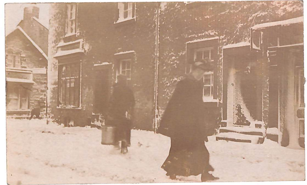
NEW ST (STATION RD) 1904