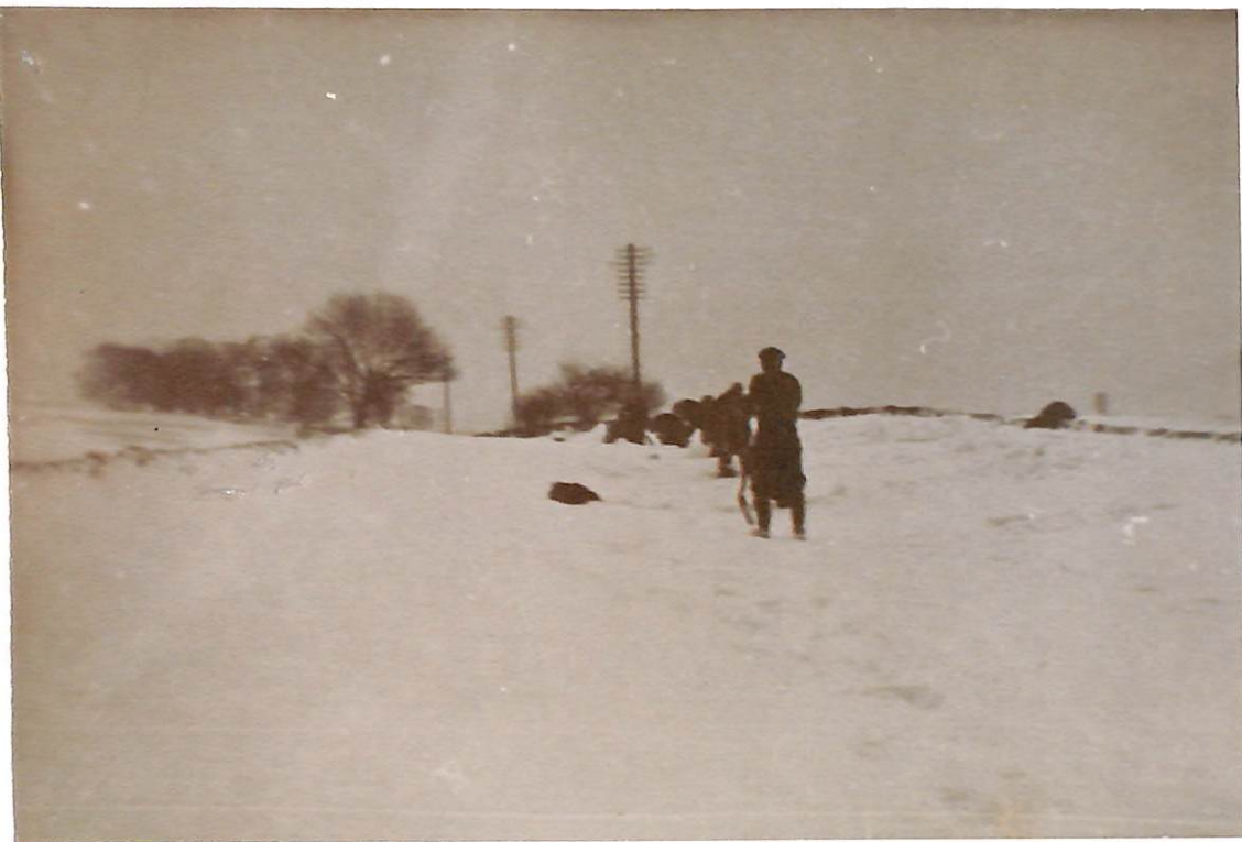
SKIRBECK BROW 1940