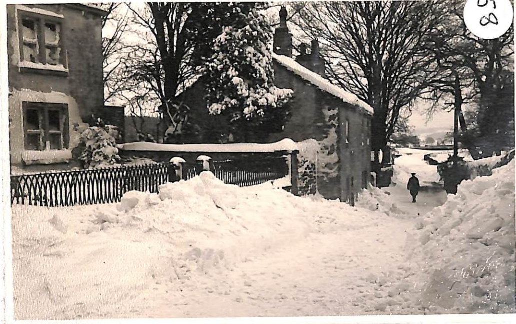
BANKWELL ROAD BELL HILL GIGGLESWICK