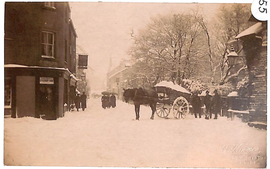
DUKE ST SETTLE