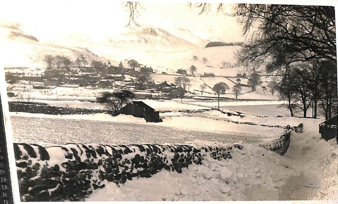
INGFIELD LANE HIGH HILL GROVE SETTLE