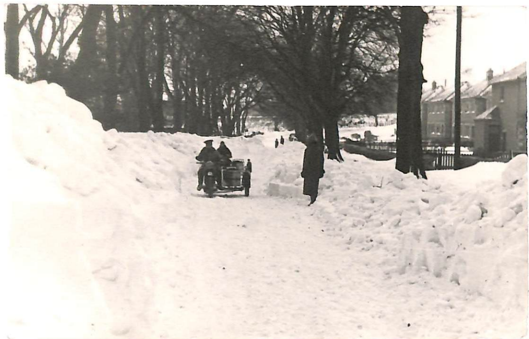
SKIPTON RD INGFIELD 1940