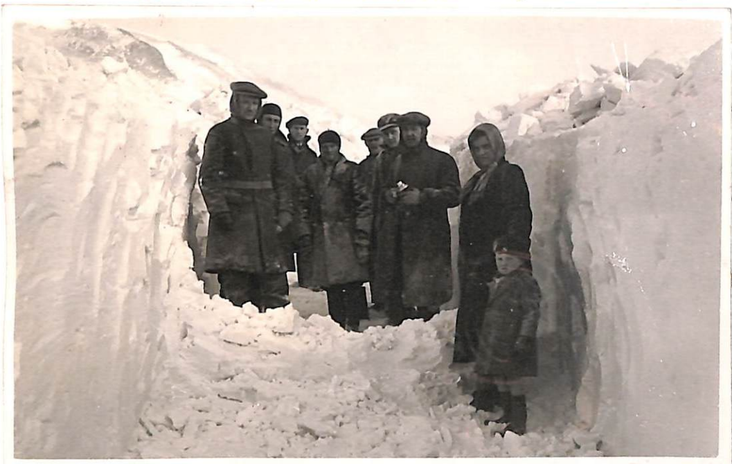
THE OLD CATHOLIC CHURCH (1940)