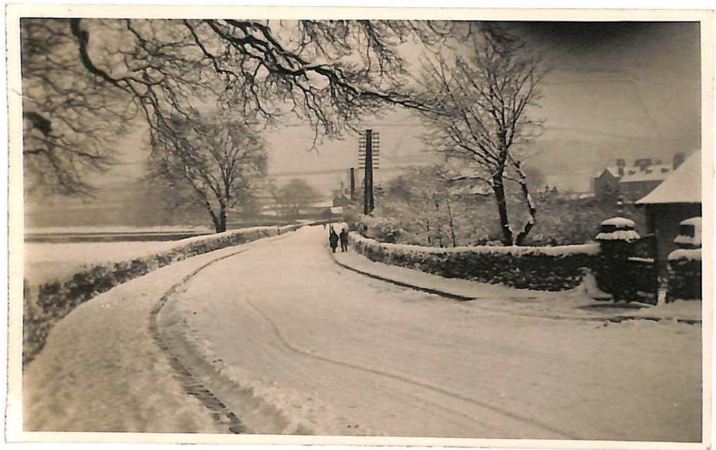
MAIN RD GIBBLESWICK TO SETTLE 1940