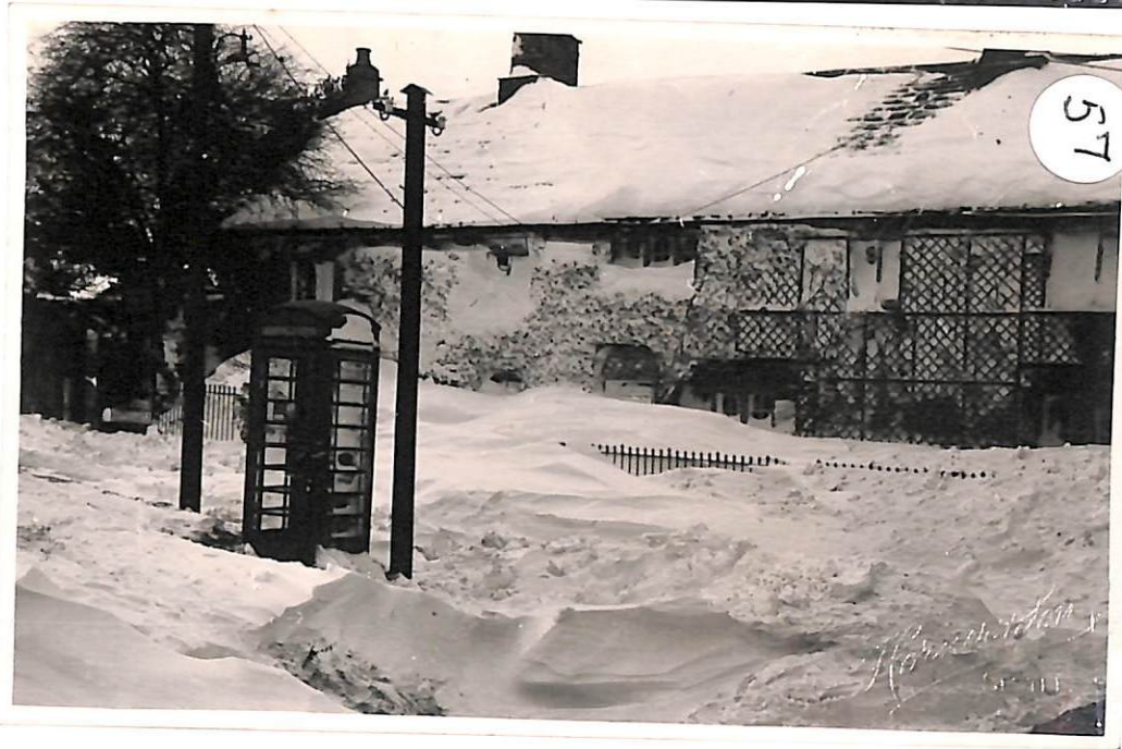
BELL HILL GIGGLESWICK 1940