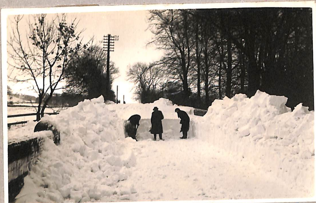
1940 The Settle to Skipton A65 main road at The Toll Bar Cottage.