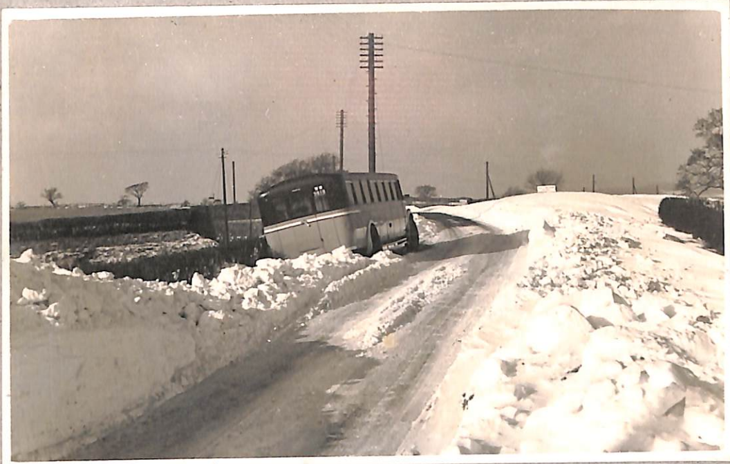
Pennine WW. 9818 at Skew Bridge Ingleton. January. 1940.