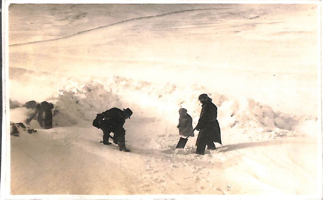
(JAN) SETTLE TO MALHAM ROAD ABOVE