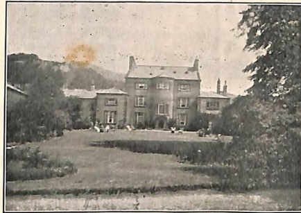
ASHFIELD HOTEL, SETTLE,