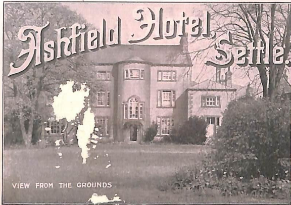
VIEW FROM THE GROUNDS