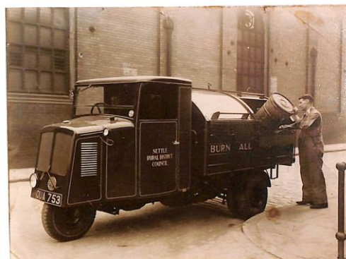
ONE OF SETTLE'S FIRST DUST BIN WAGONS