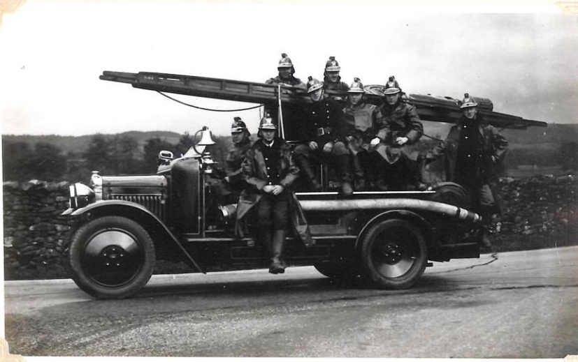
Settle Rural District Council's First Motorised Fire Engine. 1930.