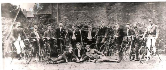
SETTLE CYCLING CLUB 1885 "ASHFIELD GARDENS"