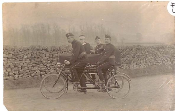
SETTLE'S ST JOHN'S AMBULANCE 1909