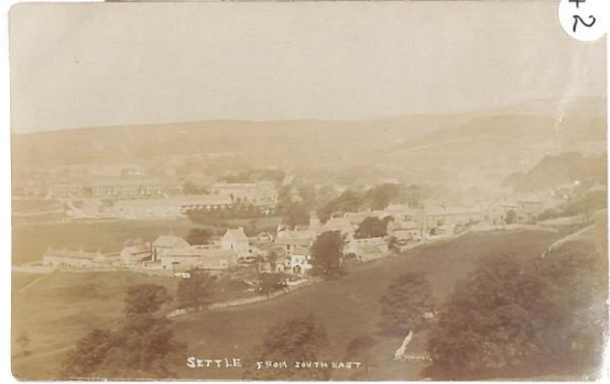
SETTLE FROM SOUTH EAST