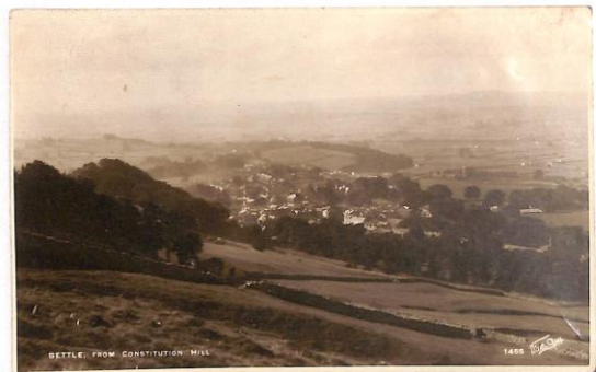
SETTLE FROM THE BANKS