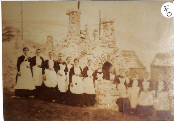
UPPERSETTLE SNOW CASTLE 1886