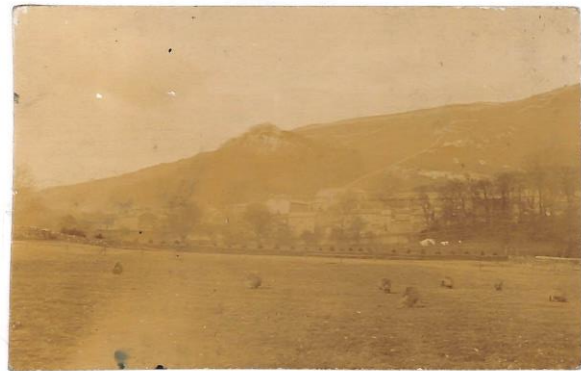
LOWER GREEN FOOT