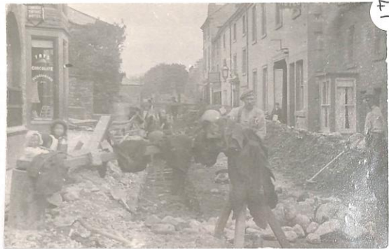
NEW SEWER LAYING 1906