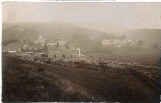
HIGH HILL GROVE