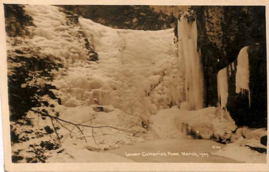
LOWER CATTERICK FOSS