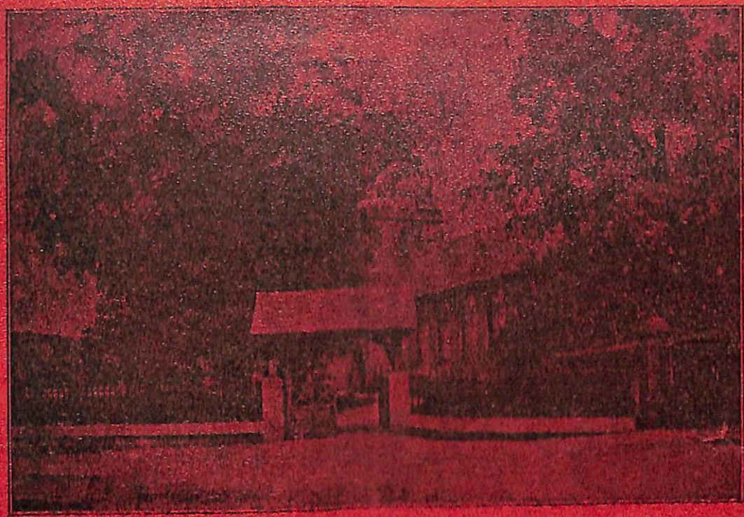
CHURCH OF THE HOLY ASCENSION, SETTLE.