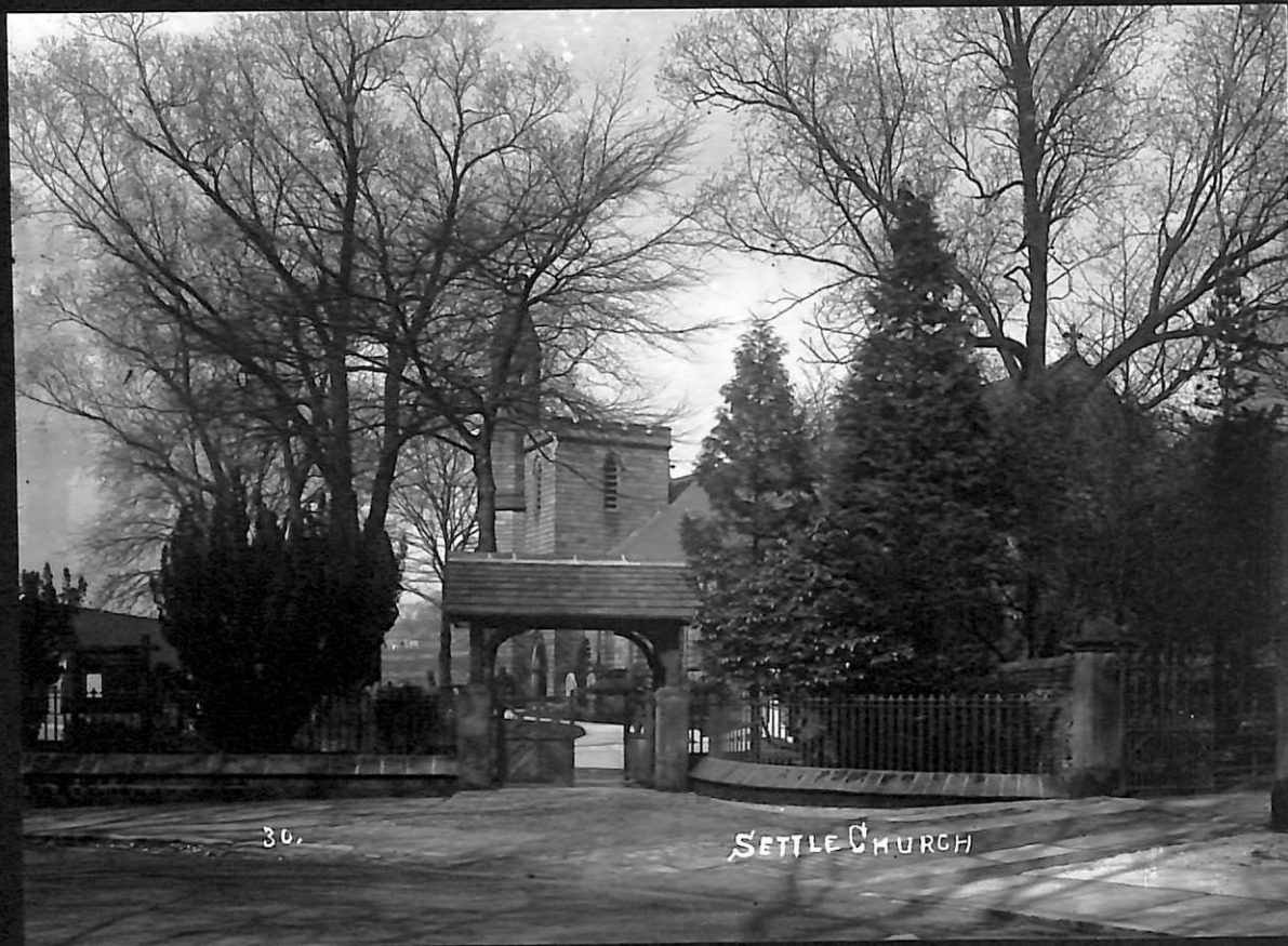
72. Settle Parish Church and Townhead Gates